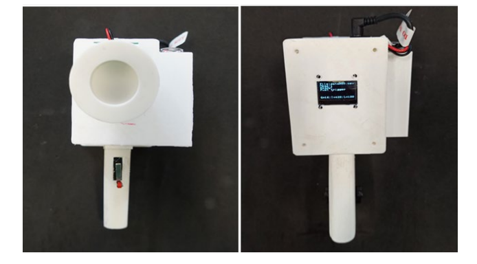
Figure 1. Custom build multispectral device.