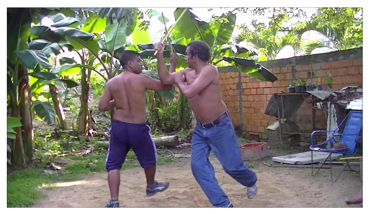
Picture 1. Playing La riña con palo style of garrote in La Piedad - Venezuela.

The definitive history of Garrote in Venezuela has yet to be written. Most research on Garrote has focused on its development in the Segovia highlands. Research the author conducted in 2005 and 2013 has shown there was or still is notable pockets of Garrote throughout many regions of the country with some local styles having possible links to Caribbean stick fighting arts. As Garrote is still practiced in a few far-flung regions of Venezuela, each with their unique history of emergence and development, the question arises was Garrote one art or many? The available evidence points to the idea Garrote emerged out of the migration from Spain and the Canary Islands. The term Garrote refers to a tapered and oiled hardwood walking-length stick, that was once an integral part of a man's public dress. The term Garrote also refers to the way the stick served as a civilian system of self-defense. By the early 20th century, Garrote had faded away along in the densely populated urban areas along the coast. However, trends moved much slower as one moved away from the coast. Until the late 1950s, in the Segovia Highlands of midwestern Venezuela, a man would not appear in public without his garrote, regardless of his level of skill. In even more rural areas, men defied the ban on carrying garrotes in public until the 1970s. Nowadays, men keep their garrotes behind their front door, strapped to their mopeds, or in the trunk of their cars when the need arises.