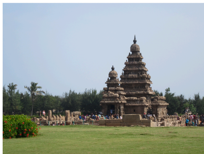
Fig. 2. The shore temple of Mahabalipuram, as seen from the southeast. View towards the Indian Ocean. The canal on Fig. 3 is between the lawn and the wall made of simple masonry.

There is a peninsula extending into the Indian Ocean today, on which the masonry Shore Temple complex stands. There was an ancient sculpture of Jalasayana Vishnu carved in bedrock probably since the time of king Narasimhavarman I Mamalla (ruled 630-668 AD). Dandin, a Sanskrit poet and prose writer in the court of Rajasimha, in his Avantisundarikathasara , reported his visit to Jalasayana Vishnu, mentioning that the sculpture is on an island, encircled by the sea (Krishnarao, 1941). The site was developed into a magnificent temple complex during the early years of king Narasimhavarman II Rajasimha (ruled 700-729 AD). A surrounding enclosure was probably left unfinished (Fig. 2). In a second phase of construction an apsidal shrine was built, strangely below the floor level of the temple complex (Sivaramamurti, 2006).