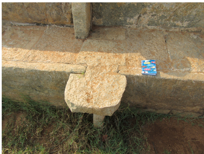
Fig. 8. Detail of masonry armour protecting the soft coast. Intricately carved blocks are tied together to resist suction force of retreating waves. ADB #2274.