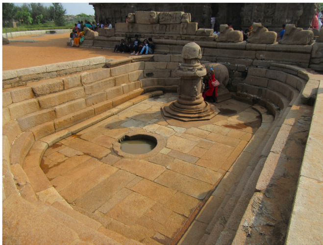
Fig. 10. Varaha well within the apsidal temple to the north of the shrine. Overlapping row of stairs indicate that the apsidal temple was built later than the shrine, after coastal uplift. Depth of the platform is 2.2 m below the shrine floor. ADB #2258.

thermochronology of the bricks or radiocarbon analysis of the mortar would give a terminus post quem date for the second earthquake. We note that liquefaction-prone sediments enable the subsidence of coastal buildings.