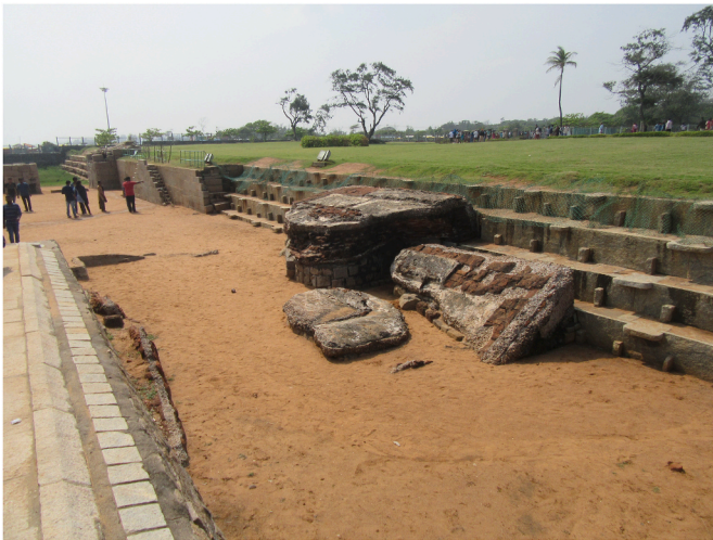
Fig. 5. Remnants of a construction postdating the Shore Temple. These were built while the sea canal was already uplifted to become part of land. Blocks are visible in various degree of tilting due to liquefaction of enclosing and underlying sand by seismic shaking. Much of masonry armour is modern restoration, overlapping the tilted walls. ADB #2166.