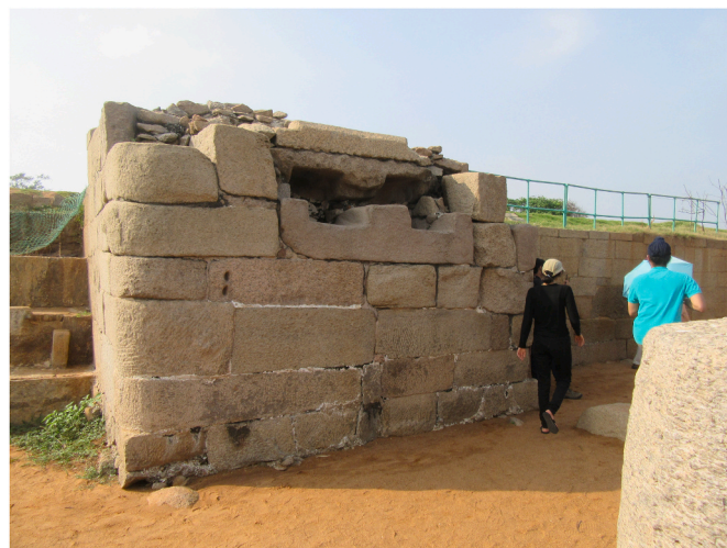
Fig. 9. Western bridgehead. Nests for two, massive stone beams are visible. The canal is never filled by the sea today. ADB #2271.

Mahabalipuram, underwater archaeological surveys reported several masonry blocks, walls, stepped construction on solid foundations, chisel marks and quarries, between low tide and 6 m depth (Vora and Sundaresh, 2003; Sundaresh et al., 2004, 2006, 2017; Sundaresh and Gaur, 2011). Unfortunately, meagre published documentation makes it hard for the reader to assess the importance of this discovery (We note that Rajani and Kasturirangan, 2013, suggested that each ‘submerged temple’ is still standing on land.). It is suggested that about half a metre of measured annual retreat of the coast is sufficient to erode 800 m of land since the temple was built, scattering masonry below sea level (Sundaresh et al., 2014). Additionally, tsunamis returning every five centuries and typhoons also contribute to coastal change by erosion (Rajendran et al., 2006). We cannot exclude that some of the underwater masonry was washed away from its original location by retreating waves, as suggested by Gaur et al. (2021).