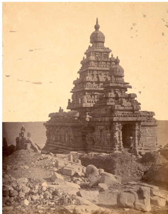
Fig. 3. Shifted blocks on top of shore temple: both are shifted towards the left, in the direction of the ocean, probably due to seismic shaking. Photographed in 1885. Intensity I = IX. https://www.reddit.com/r/HistoryPorn/comments/85i2hs/the_shore_temple_8th_century_shiv_temple_built/ Accessed 20 July 2020.

The sediment-filled canal, which separated the Shore Temple island from the mainland, is bordered by two stone walls. Heavily restored portions partly underlie and partly overlie various stone-and-brick masonry constructions. These walls and floors deviate from the vertical and