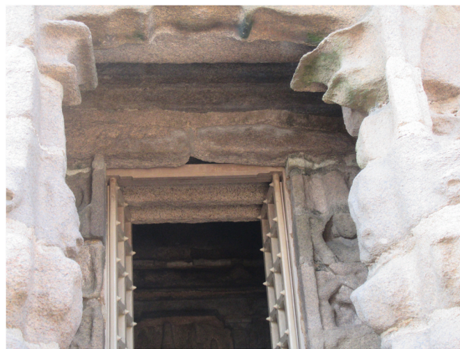
Fig. 4. Broken lintel on the west gate of the Shore Temple. ADB #2226. Penetrative fracture in masonry block. Intensity I = VII or higher. (Rodríguez-Pascua et al., 2013).

the horizontal, respectively (Fig. 5). This deviation, yielding up to 80° westward tilt for a former floor (Fig. 6), is a feature of subsoil liquefaction. It can happen during seismic shaking: increasing pore pressure separates grains in water-saturated sand, making it behave like fluid. Walls, heavier than water, tilt, overturn, and sink in the fluidized sediment (Khan-Mozahedy, 2015). This happened to the building(s) built on