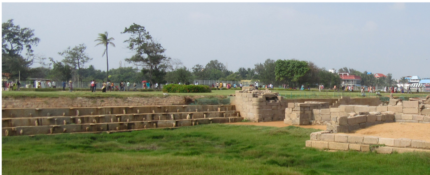
Fig. 7. Seawall protecting the shore (left). Bridgeheads of the ruined bridge (right) are above the canal surrounding the Shore Temple island. View to northwest. ADB #2212.