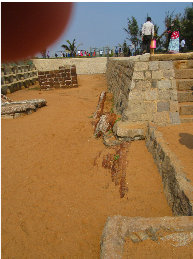
Fig. 6. Vertical layers of brick masonry wall, result of liquefaction of sandy soil due to seismic shaking. ADB #2173.