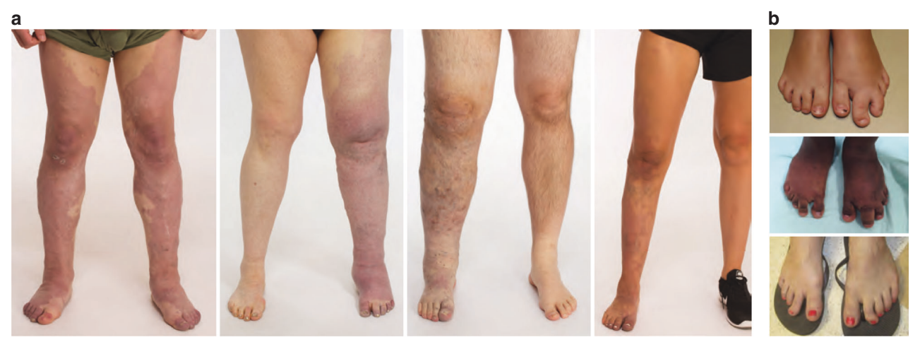
Fig. 2 Patient photographs of characteristic clinical phenotype. (a) Capillary venous malformation with limb overgrowth (Klippel–Trenaunay). (b) Macrodactyly with sandal toe deformity.