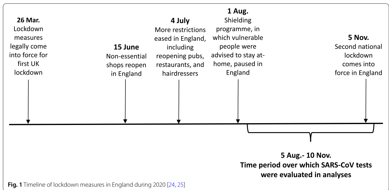
Fig. 1 Timeline of lockdown measures in England during 2020 [24, 25]

The UK Biobank cohort included 502,488 participants at the time of this study, 323,075 of whom reported a job at their baseline assessment visit that could be linked to O*NET information (Fig. 2). Of those, 143,477 (44.4%) were less than 65 years of age and still in follow-up in