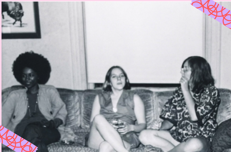
Women of Jane

It had gotten as far as to have underground abortion clinics, one to which used the code name "Jane". Stationed in Chicago, this group of women advertised on bulletin boards and bus stops to give women the opportunity for a safe and affordable abortion. In 1972, 7 members of the clinic were arrested under abortion charges but a couple months later were released because of the passing of Roe v. Wade on January 22, 1973.