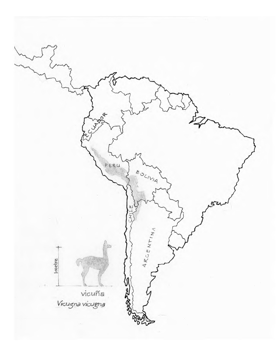
Fig. 14.4 Present-day range and approximate size of vicuñas throughout South America. Drawing by Colleen Campbell.