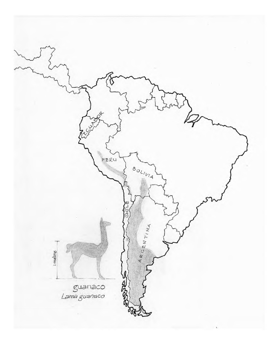
Fig. 14.3 Present-day range and approximate size of guanacos throughout South America. Drawing by Colleen Campbell.