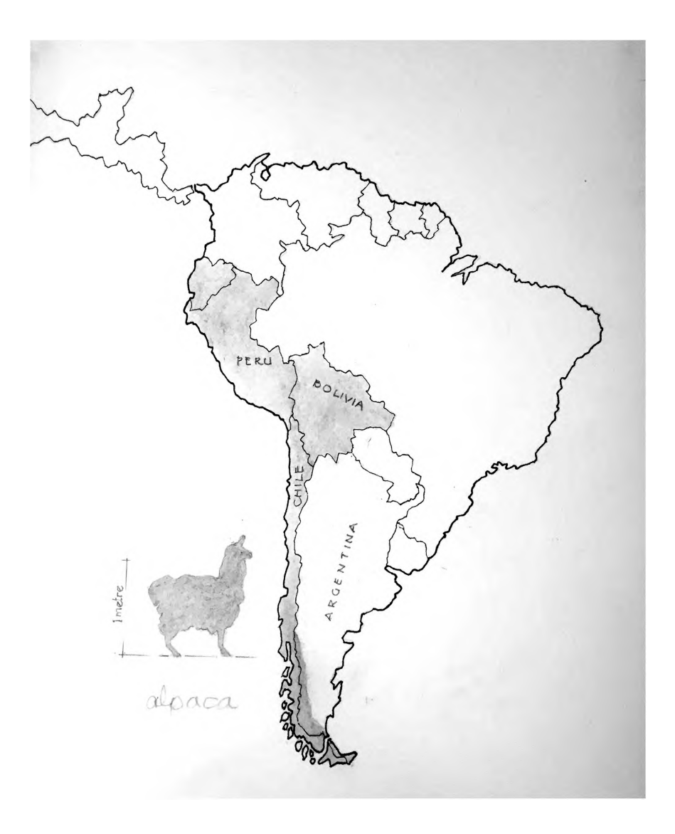
Fig. 14.2 Present-day range and approximate size of alpacas throughout South America. Drawing by Colleen Campbell.