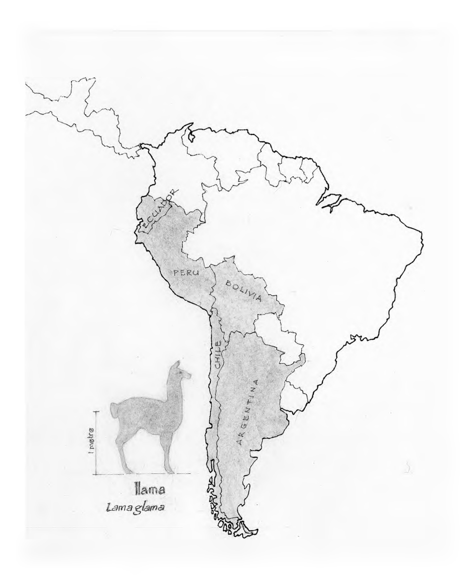
Fig. 14.1 Present-day range and approximate size of llamas throughout South America. Drawing by Colleen Campbell.