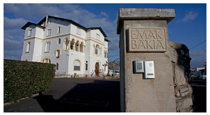
The mysterious house Emak Bakia