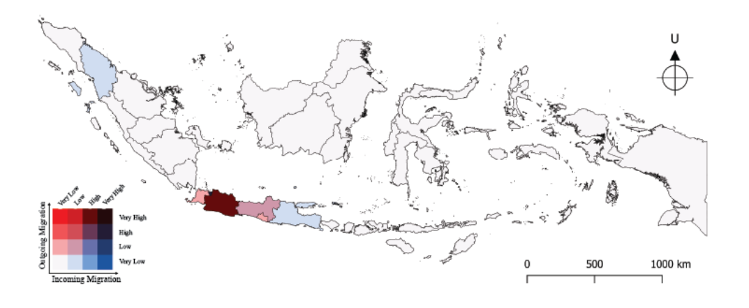
Figure 1. Thematic Map Representing the Number of Incoming and Outgoing High-Skilled Migrants by Province in Indonesia in 2015

In addition to an overview of the micro characteristics of migrants, we will also look at a macro overview of high skilled migrants, namely through the thematic map in Figure 1 and through the circos plot in Figure 2.