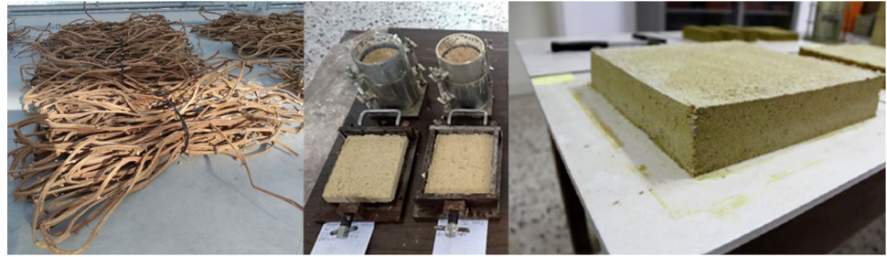
Fig. 3 Tomato plant stems (left) used for the production (middle) of the new infill wall material (right)

characterized by different properties and densities and, consequently, the total mass to achieve the FU varied for each of them. That is, for the same fixed value of thermal resistance (as reported in Sect. 2.2.2), in sample A it was decided to enhance mechanical characteristics, while in sample B it was decided to enhance thermal characteristics. Therefore, FU of sample A is characterized by larger thickness and heavier weight than FU of sample B. To do this, the composition of the two samples was made to vary as shown in Table 1. Nevertheless, it should be stressed again that, since the new bio-composite material is intended to be used as a sustainable alternative to other most commonly used building envelope infill components (i.e. hollow bricks, tuff blocks and light concrete blocks), both samples are able to meet the minimum characteristics required for such a type of building element.