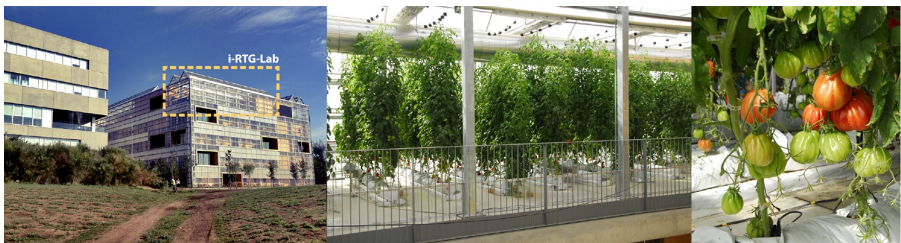
Fig. 1 ICT-ICP building (left), inside of the i-RTG-Lab (middle) and experimental tomato crop (right)

In order to fully and thoroughly assess the environmental impact of the two samples (A and B) of the new material three main aspects were investigated. Precisely, other than performing a classic Life Cycle Assessment (LCA), it was decided to also estimate the carbon footprint and the embodied energy indicators (that are based on the LCA methodology as well), for a dual scope as better explained in the following. Specifically, the carbon footprint and embodied energy indicators were chosen mainly for the purpose of making a comparison between the new material and some other conventional (non-natural-based) most commonly