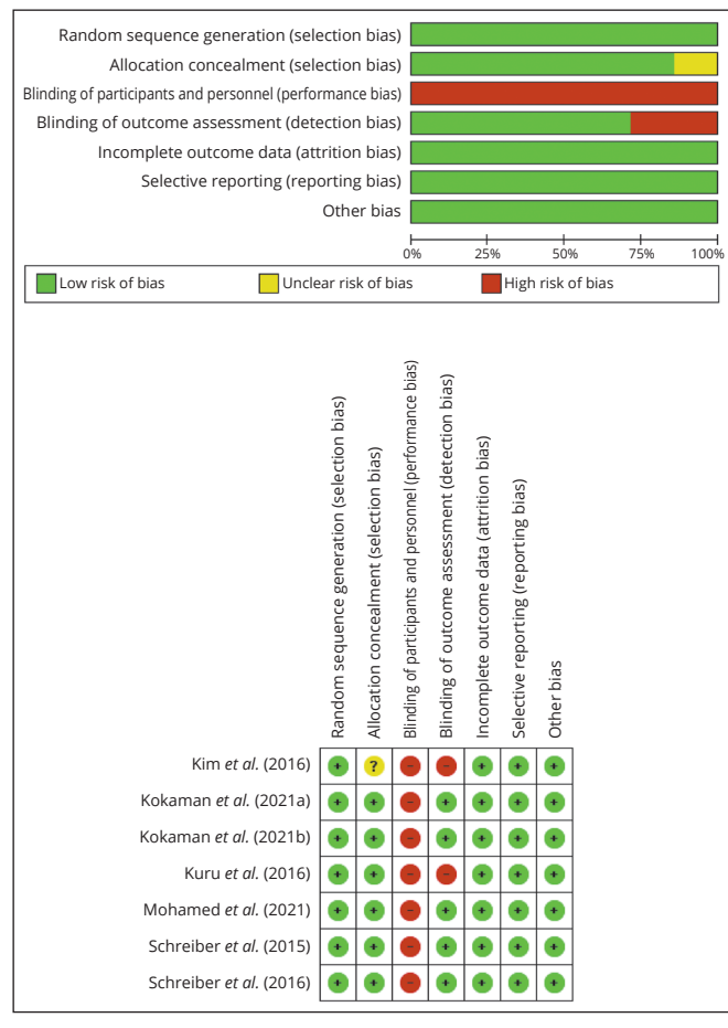
Figure 2.—Risk of bias Cochrane tool.14, 26-30

risk ratio crossed the null value, when the sample sizes were <50 individuals and two levels when the sample sizes were \le30 individuals).<sup>20, 21</sup>