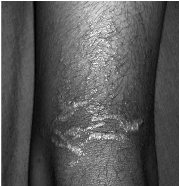
Figure 1. Lichen planus-like cutaneous lesion: multiple violaceous papules over the lower part of the left anterior thigh and also over the patellar region. The lesions were discrete as well as confluent in linear fashion in parallel rows mimicking lichen planus.

affected parts along with a skin rash, comprising blisters, redness and superficial ulcerations. There were no systemic symptoms. The initial symptoms subsided with conservative management, including a systemic antibiotic, an analgesic and an antihistamine, but some peculiar asymptomatic skin lesions persisted, compelling him to seek a dermatological consultation. There was no history of any local application on the sites of the jellyfish sting and he reported no past history of any skin disease. In addition, there was no history of a similar illness in the family.