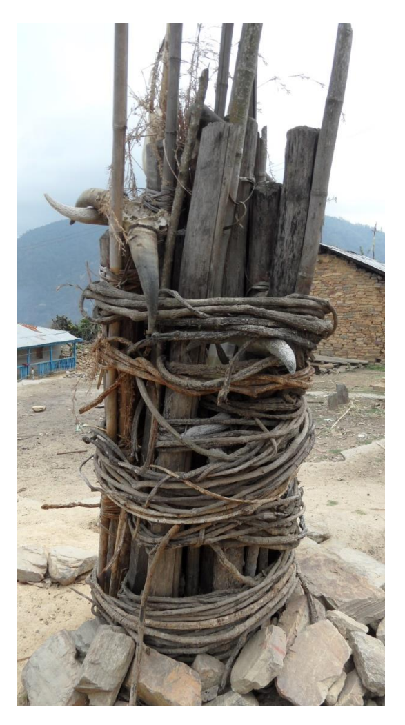
Figure 9: The dzongnõ in Khoina, around which the community rituals are centred.

central structure at which it takes place (see Figure 5 for the megaliths in Jerigaon and Figure 9 for the bamboo, vine, wood, and foliage structure in Khoina), the reliance on orally transmitted liturgy rather than on written scriptures, and the general structure and outline of the rituals is clearly relatable to the traditional animist beliefs and rituals of the Miji, Hruso Aka, Puroik, Nyishi and other tribes to the east. This attests to an ancient indigenous ethnolinguistic stratum that precedes subsequent additions from Tibet.