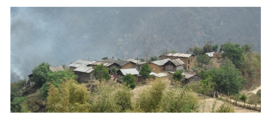
Figure 3: The clustered Sartang village of Khoina.

Hence, Sartang encompasses the four distinct linguistic varieties that, depending on which criteria are applied, can be considered four dialects in a dialect continuum, two distinct languages, or even four distinct languages. To add to the complexity of the situation, although generally considered a separate language and certainly regarded as a separate Scheduled Tribe, the two varieties of nearby Sherdukpen could, again depending on the criteria applied, be considered part of the same language, dialects within the same dialect continuum, or two dialects of a separate language.