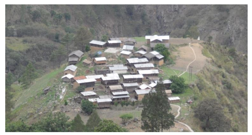
Figure 4: The clustered Sartang village of Rahung.

The Sartang varieties are spoken in four main, original villages and several hamlets, many of which came into existence only in the last two decades along the main roads through the area. The Rahung variety is spoken by around 600 people in the original Rahung village (Figure 4) and the hamlets of Darbu ('Chauda Mile / 14 Mile'), Dangsing ('Chaubis Nala / 24 Stream'), Tinghe Pam, 'Che Mile / 6 Mile', 'Paanch Mile / 5 Mile', 'Nau Mile / 9 Mile' and Sandanpam ('Tin Mile / 3 Mile'): as many of the Hindi names of these hamlets indicate, they are mostly located along the Bomdila to Dirang and Bomdila to Nafra roads. The Khoitam variety is spoken by around 500 people in the original Khoitam village, in Khodru hamlet ('Labour Camp') on the Bomdila to Nafra road, and in the fast-growing settlement of Salari (local name Mosihi), which has developed into a kind of central Sartang 'capital'. The Jerigaon variety is spoken by perhaps 400 people in the village of Jerigaon and the settlement of Kirafarm (from Hindi कीझ kīdā 'bug', i.e., a place housing a silkworm farm), whereas the Khoina dialect is spoken by around 500 people in old Khoina village (Figure 3) and the nearby hamlet of Dingchang, in the settlement of Saidel (local name Deshuk Leca) on the Bomdila to Nafra road, and in the remote hamlet of Dünglo on the opposite bank of the Gongri river.