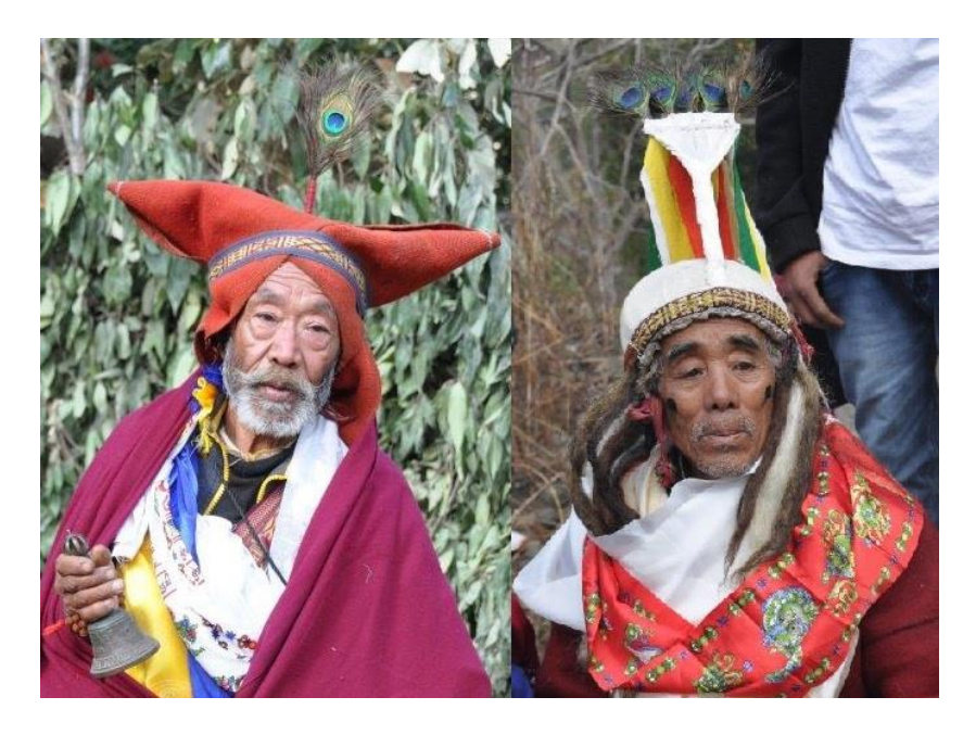
Figure 11: Two Sartang religious practitioners with distinctive headgear during annual communal rites, Rahung, January 15<sup>th</sup>, 2020.

While the rituals for the Phu and Da are commonly in a hybrid language of Sartang, Tibetan, Tawang Monpa, and Tshangla, the Tangyü rituals and the orations during the curative rituals are commonly in Sartang. In addition to their ritual function, the chikji are also the repositories of the Sartang history. They have memorised the origin and migration histories, know the background and origin of all the clans, and are hence important repositories of knowledge about the Sartang.