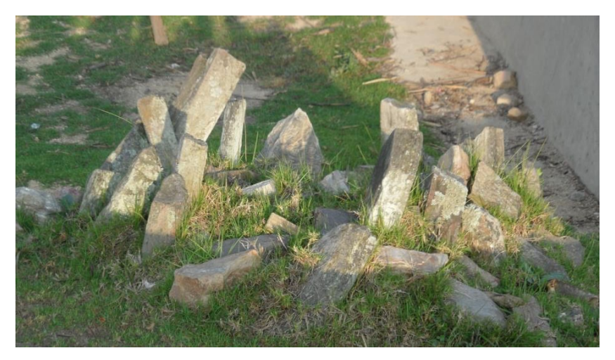
Figure 5: Megaliths in Jerigaon.

adzes are common. In Jerigaon, the ground where all the community rituals and festivals are conducted has a collection of lying and standing megaliths<sup>2</sup> in its centre (Figure 5).