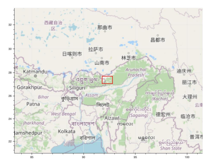
Figure 1: The eastern Himalayas, with the area of Figure 2 indicated (baseline \bigcirc OpenStreetMap contributors, modified by Mei-Shin Wu, used with permission).