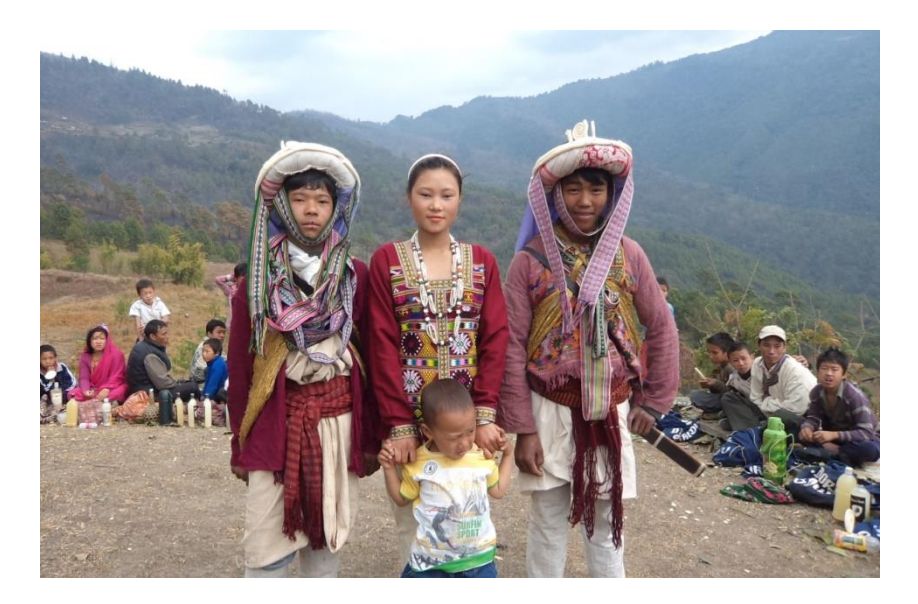
Figure 10: Two male bropa with characteristic turbans during a community festival in Khoina village.

The local deities are called Phu and Da (sometimes Phü and Do in local speech). The Phu are positive, pure, and clean deities of the higher peaks, mountains, and ridges, and provide sustenance to the people through the natural resources, including the land, the water, the forests, and the animals. The Da are negative, impure, obscure inhabitants of low-lying groves, marshes, swamps, and ponds, and can cause obstruction to people through epidemics, mental and physical illness, loss of cattle, natural disasters, and weather phenomena. Their propitiation takes place during annual rituals in the individual villages. Whereas animal sacrifice was earlier part of the ritual, in many cases, this has now been replaced by the release of 'ransom' cattle in the forest. The deity is believed to inhabit the hump of the animal for a year, and the next festival, the deity temporarily ascends from the hump, receives its offerings, and descends back into the hump. The names Phu and Da and the practices associated with them, such as the male bropa and the female broma , young virgin acolytes of the ritual specialists (see Huber 2020: 442-443, 507). have parallels among the practices found across eastern Bhutan and western Arunachal Pradesh. They appear to have an origin on the Tibetan plateau, and this practice has been partially absorbed in local Tibetan Buddhist ritual.