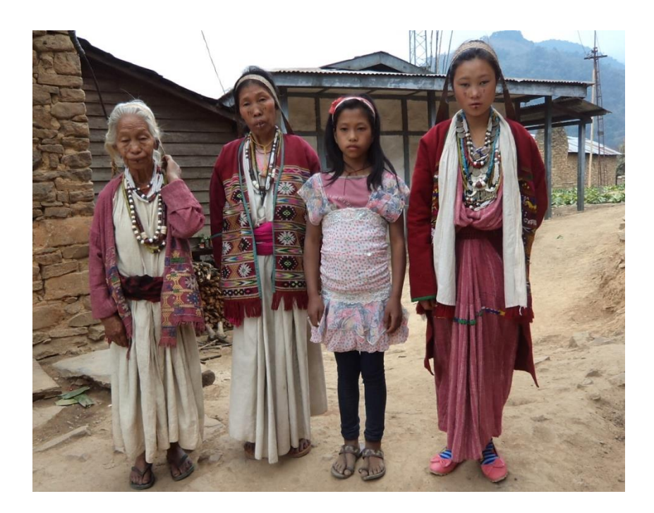
Figure 8: Three generations of Sartang women in Khoina on their return from a community festival. Obvious intergenerational changes in the favoured dress and apparel are often mirrored in differences in language use and attitudes to the mother tongue.

One of the ways in which the Sartang language could be promoted is through mother tongue education in the local primary schools, the benefits of which are widely recognised, including by UNESCO, which advocates for 'multilingual education' in at least three languages in education: the mother tongue(s), a regional or national language, and an international language, with education based on the mother tongue(s) in the early years of schooling.<sup>11</sup> Similarly, Article 30 of the Indian Constitution states that linguistic minorities have the right to establish and administer educational institutions, and Article 350A states that: