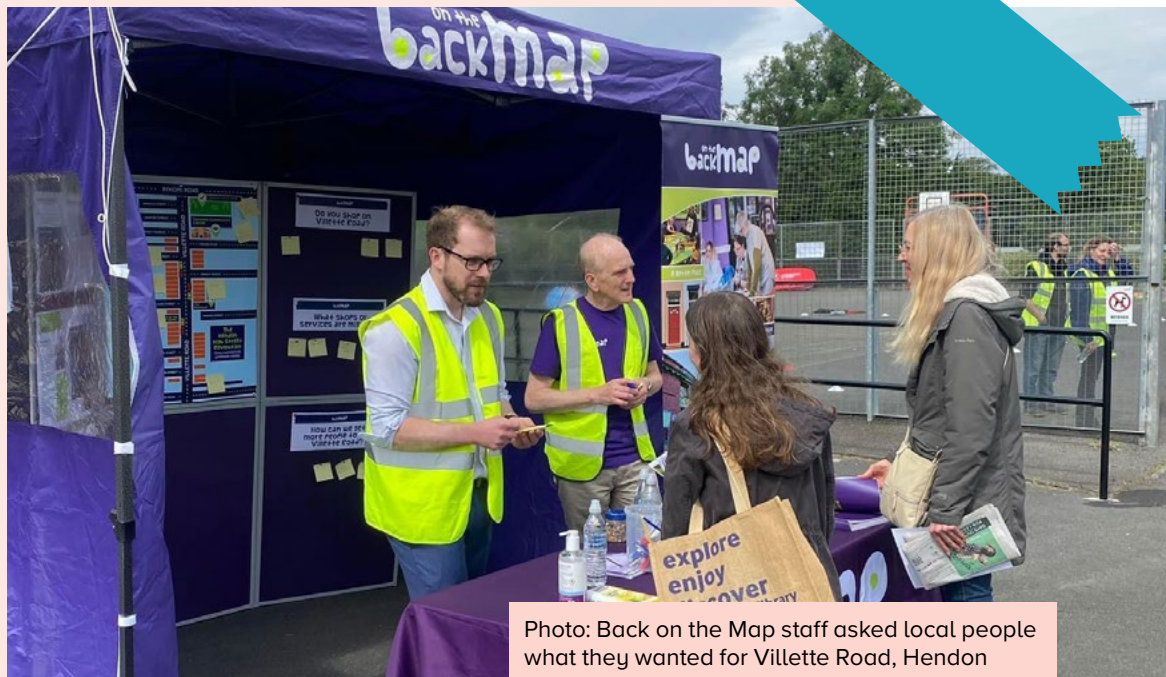
Photo: Back on the Map staff asked local people what they wanted for Villette Road, Hendon

Back on the Map is a well-established community anchor organisation with a 20-year track record, dating back to the New Deal for Communities scheme of the early 2000s. The focus of the CID is Villette Road, a neighbourhood high street that has become run-down and is characterised by a block of properties where the ground floor shops are all closed, although the upper floors are used for residential tenancies. Action has focused on creating a new branding and marketing strategy for the street, bringing together traders and residents, highlighting local heritage, and working with property owners to bring long term vacant units back into use.