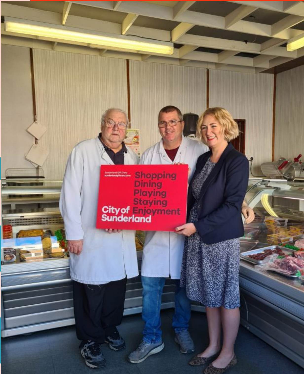
Photo: In Hendon, traders joined a gift card scheme for the city - which brought an additional £9,000 of trade to the street