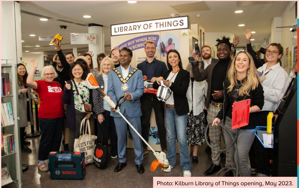
Photo: Kilburn Library of Things opening, May 2023.

The pilot Community Improvement Districts (CIDs) programme in England took place between May 2022 and June 2023 across seven locations. Two high streets in London (Wood Green and Kilburn High Road) received £20,000 grants from Power to Change and £20,000 from the Mayor of London. A further five locations outside London (Hendon in Sunderland; Ipswich; Skelmersdale; Stretford in Greater Manchester; and Wolverton in Milton Keynes) each received £20,000 from Power to Change. The Centre for Regional Economic and Social Research at Sheffield Hallam University and Shared Assets CIC acted as learning partners for the programme.