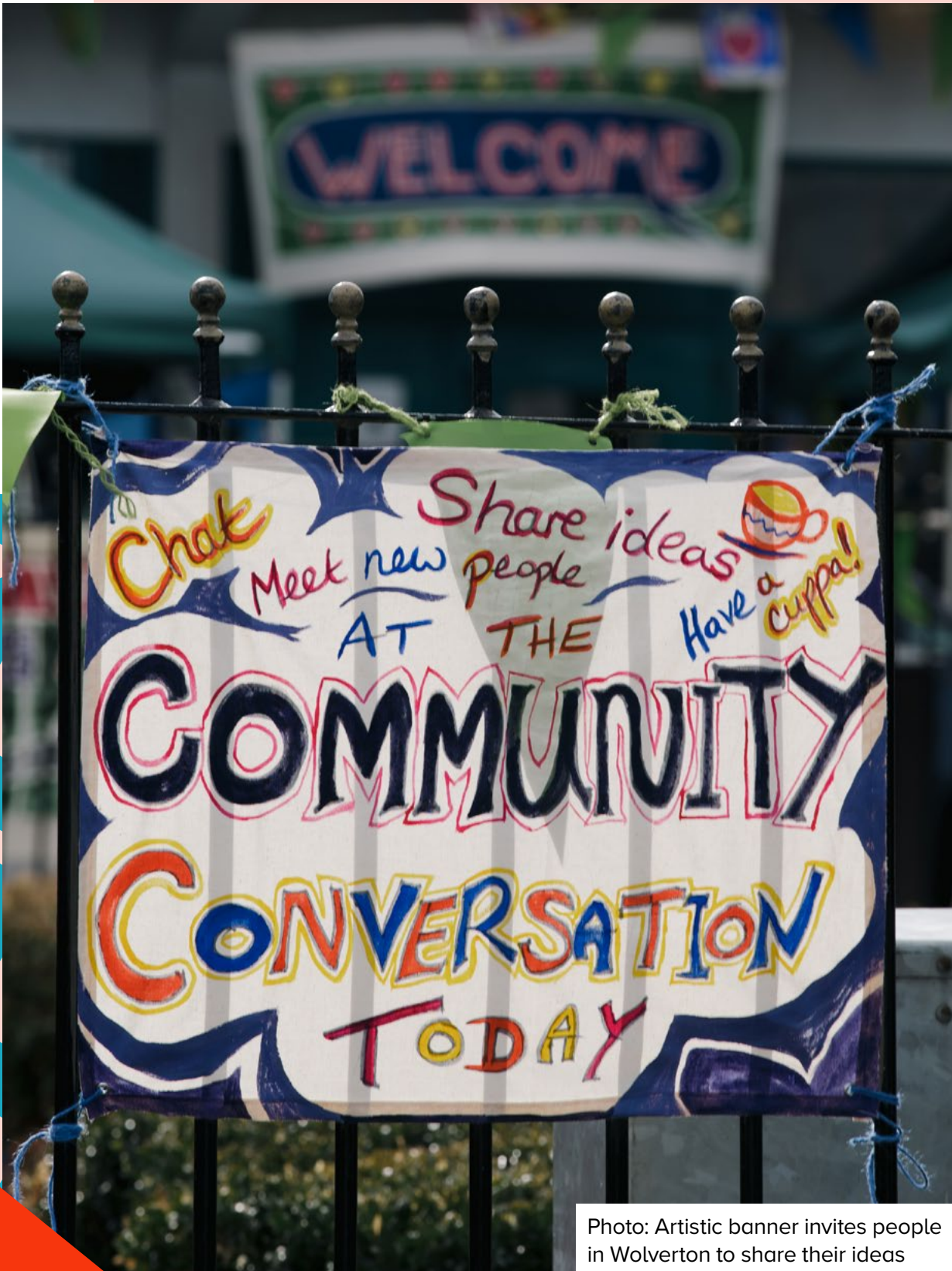
Photo: Artistic banner invites people in Wolverton to share their ideas