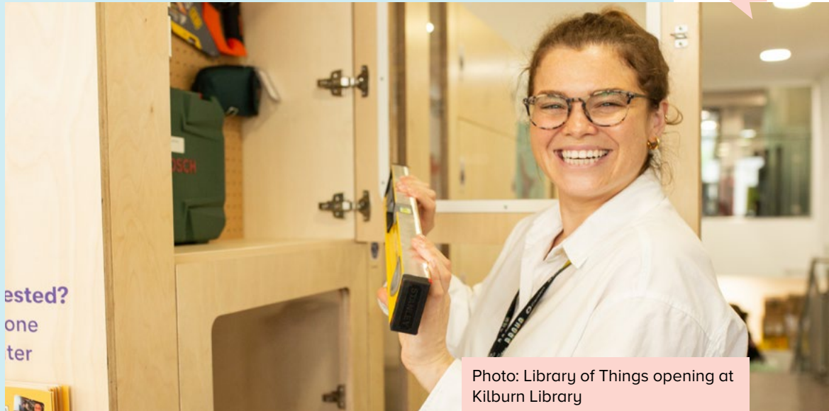
Photo: Library of Things opening at Kilburn Library

Kilburn High Road is also the boundary between the London Boroughs of Camden and Brent (and includes the northernmost point of Westminster). Despite being designated a major town centre with excellent public transport connections and many independent businesses, it's a place of many challenges.