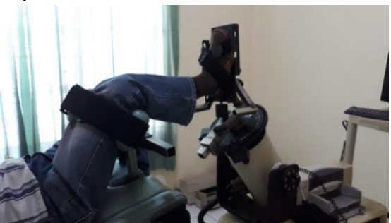
Figure 2. Isokinetic dynamometer position

The independent variable was the elastic taping procedure, and the dependent variable was DCR of ankle evertor-invertor. Data normality was confirmed using the Kolmogorov-Smirnov test. Results were evaluated for statistical significance (p<0.05) using paired t-test (parametric) or Wilcoxon Signed Ranks test (non-parametric). All subjects had signed the informed consent form and the study was approved by the ethics committee in Dr. Soetomo General Hospital.