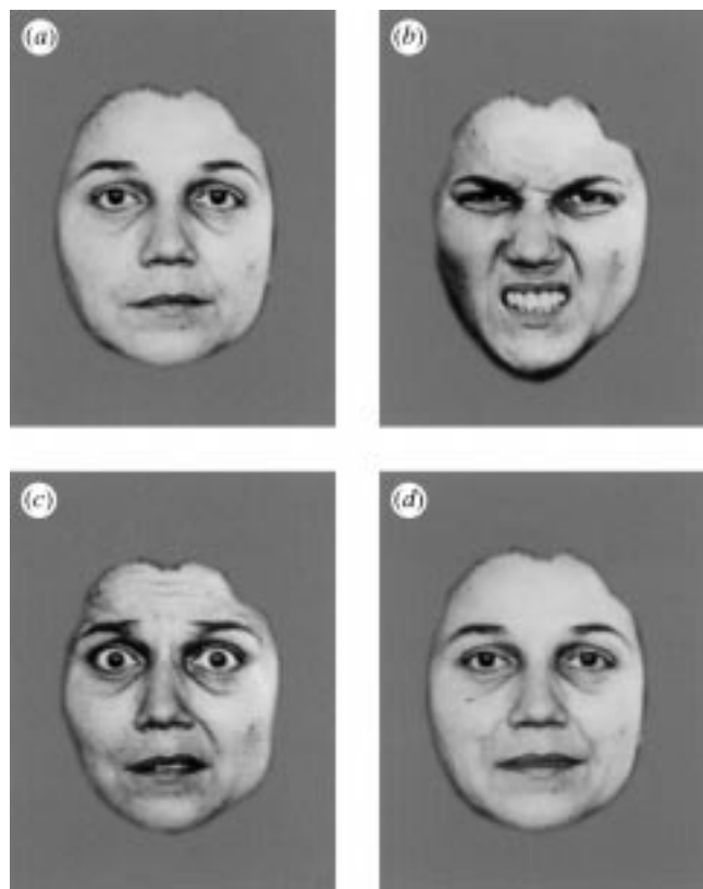
Figure 1. Faces from the standard set of Ekman & Friesen (1976). Examples of faces depicting 100% neutral (a), 100% disgust (b) and 100% fear (c) are demonstrated, along with an example of a stimulus depicting a mildly happy expression (75% neutral and 25% happy) (d) used as the emotionally neutral baseline condition in both experiments using facial stimuli.

The subjects were requested to decide the sex of each face or voice and press one of two buttons accordingly with the right thumb. The subjects were not informed that the purpose of the study was to examine the neural response to emotional stimuli. This sex-decision task has been used in previous studies investigating the neural response to emotional stimuli (Morris et al. 1996; Phillips et al. 1997) and allows an identical task and response across the four experiments. These studies have shown that the neural response to facial expressions of emotion does