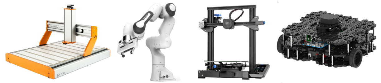
Figure 2. desktop production assets (low-force/scaled) with industry-standard interfaces.

training. Dependent on the machine type, a minimum number of students/staff can be required to check-in at a machine before it may be operated. Next, the production/assembly line in the learning factory employs a specific type of equipment: lower-force/scaled machines, but with control systems identical to the controllers on industrial-scale counterparts (see figure 2). With that, the students experience the same interfaces and programming as used in industry, yet at relatively low-cost machines, rendering any errors, mistakes or experiments significantly less impactful. For example, in the assembly line, different types of robots are used that 'speak the same language' (in this case Robotic Operating System (ROS)) as any full-scale version. The same yields true for e.g., the automated guided vehicles (AGV), or controllers of the desktop CNC-machines. With that, it is certainly not the intent to make the learning factory as robust as possible – rather, by design, resilience is an inherent part of the thinking behind its design.