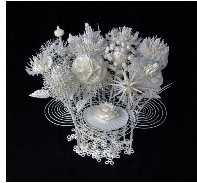
Figure 5: 3D printed art named Mazzo di Fiori (bouquet) by Joshua Harker© (image from www.joshharker.com ).

For prevention, all stakeholders in society should engage in micro and macro initiatives of mitigation or radical change [48]. Humans need to be convinced that their current actions impact not only their own well-being and way of living, but also that of future generations [80]. In other words, we need help to grasp the complexity of a sustainable future – and what actions need to be taken to achieve that. HCI research to date has focused on raising awareness, e.g., through feedback in home energy systems