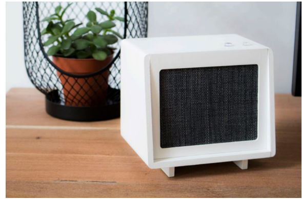
Figure 3: Rain is a smart home assistant that becomes possessive and controlling over time. Users can judge its potential toxicity when it “reigns” over their lives.

3.1.2 Insights. Rain was deployed with two couples, who were interviewed before and after the deployment. The interviews were thematically analyzed. Participants were also asked to fill in a 5-point scale that ranged from invasive to protective, concerning the five topics that were addressed by Rain, i.e., finances, health, maintenance, monitoring and security. Findings showed that participants preferred a supportive smart home over an executive, dominant artefact. The masculine role of the assistant created resistance and aversion, specifically when Rain acted upon its own values that reflect toxic masculinity. Findings showed that participants felt uncomfortable when Rain would make decisions on their behalf. One participant indicated that when Rain made financial decisions that “these are things I like doing, then I asked myself: what am I still doing here?”, regarding her loss of autonomy. Between the four participants, the preferred set boundaries for such a system vastly differed, although they appeared to be most protective about data that they deemed personal. Control over finances, such as repaying a friend for a dinner or switching to a different energy provider, was considered a no-go by all participants. When Rain started speaking