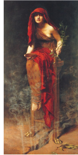
Figure 2: Ancient Greeks consulted the Oracle of Delphi for future forecasting and prophecies. The image shows the painting, Priestess of Delphi by John Collier (1891).

Such embedded voices can narrate stories and perspectives from the point of the body that they are in, or one can imagine distributed voices of a single entity, residing in multiple bodies, e.g., Tachikoma robots from Ghost in the Shell that are connected as a distributed AI system that recalibrates its consciousness by syncing nightly. The sleek look of smart speakers is not all there is to “bodies”. Metaphorically, conversational agents can be modern-day oracles, e.g., the Oracle of Delphi in Figure 2, motivating actions towards futures we imagine and consider to be worth wanting. Through explorations with CUIs, we may rethink, examine, doubt, critique, and topple our own expectations.