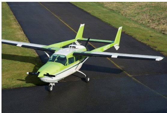
Fig. 1. Cessna 337F Skymaster (DEAC).

Currently, research is being carried out on the design and development of electric aircraft in the Netherlands by different organizations. The Dutch Electric Aviation Center (DEAC) is one of them. It is a knowledge center based on the Teuge International Airport (TIA) and focuses as a center of expertise on General Aviation (GA): flying, regulation, maintenance, and infrastructure modifications. The main goal of the DEAC is to stimulate flying on batteries or hydrogen. DEAC is using Cessna Skymaster 337F as a testbed. This aircraft piston twin engine in a so-called push-pull configuration, one pushing propeller in the rear of the fuselage and one tractor (pulling) in the nose of the aircraft. The linear configuration does not allow the aircraft to yaw towards the engine when the other engine fails, making it ideal as a testbed for electrification (see Fig. 1).