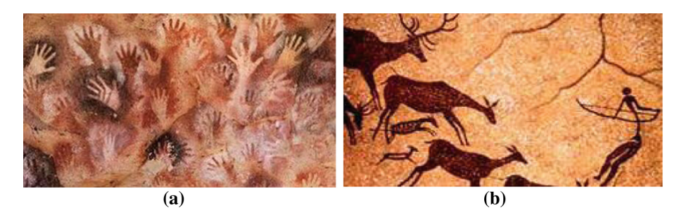
Fig. 1. Lascaux Cave Paintings, France, Lascaux, ca 17000 BC [3]

Prehistoric cave- or rock paintings represent the earliest forms of painting that survived, traced back to 40 thousand years ago. We experience a hint of the spiritual life of our ancestors, and we may imagine the intended audience (members of the same tribe, gods), who were supposed to (actively) interpret and understand the message as depicted. Figure 1a shows how the artist triggers his audience to see a depicted hand, where "she" (According to archaeologists, these are feminine handprints.) in fact, paints the space around the (invisible) hand – the audience will "fill in" the invisible. The deer in Fig. 1b may well represent something related to hunt, and tribal relatives of the artist will have known much more about the values, activities, and emotions related to the scene than modern viewers will ever be able to understand.