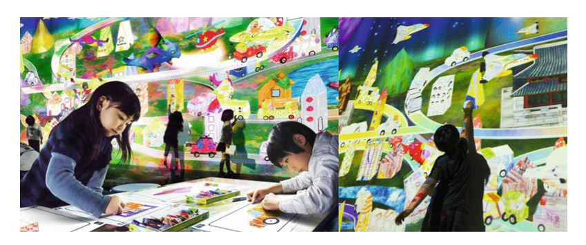
Fig. 9. Sketch Town, Co-Creation Art, Team lab, Japan, 2017 [15]

Chinese Artists Play with Their Audience. The work "Life · Hair" (Fig. 10) was created by students at China Central Academy of Fine Arts. The main material is embroidered women's hair on silk. Artist uses technology (the principle of static electricity) to let the audience feel the delicate emotion of women through their touch. For technical solutions, the artist collaborated with students majoring in nuclear physics at the Tsinghua University. So, the artist calls it a cross-border art.