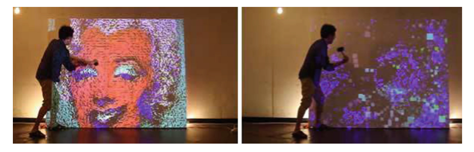
Fig. 8. Breaking Andy Wall, Interactive Art, Leo Kang

Experiences in the Different Contexts. From our analysis of museums, galleries, and international conferences we detect an amazing jump in the impact of technology on art. We will discuss some examples from the art exhibition at CHI 2016, San Jose: 'Breaking Andy Wall' (Fig. 8) is an interactive installation. When participants smash the canvas with the hammer, they can gradually break down the art piece. Through the playful destruction and reconfiguration of iconic art pieces, this installation reconfigures relations between art objects and their audiences [14].