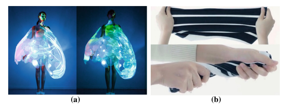
Fig. 12. Bubelle Emotion Sensing Dress. Design group at Royal Philips Electronics. Netherlands. 2007 [19]; Fabric Strain Sensor, AdvanPro. Hong Kong [20]

Wearable Art - Interactive Textiles. Wearable devices are not just a hardware device supported through software, data exchange, and online interaction [18]. Wearable devices may have powerful effect on our perception of life. Smart fabric in wearable devices is a very representative case. The trend is to make core computing modules smaller (to nanoscale units), and they are increasingly being used by artists. Philips Design gave (in 2007!) a glimpse of how will fashion look in 2020 (Fig. 12a): The Bubelle Dress changes its look instantaneously according to wearer emotional state. It is made up of two layers, the inner layer contains biometric sensors that pick up a person's emotions and projects them in colors on the second layer, the outer textile, though limited to the sensor module and bulky looks [19].