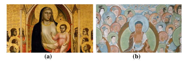
Fig. 4. Halos of Christian gods (Giotto di Bondone: Ognissanti Madonna. Italy. c. 1310) and Buddhist gods (Dunhuang Mural. China. ca. 538 AD) [6, 7].