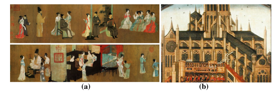
Fig. 7. Han Xizai Evening Banquet, China, 937-975 AD [10]; John Gipkin, Bishop King Preaching at Paul's Cross before King James I. (1616) [13].

New developments in artistic techniques allowed, and triggered, active behavior of the audience: horizontal Chinese scrolls require the viewer to walk the painting from the start of a story to the end (Fig. 7a).