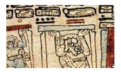
Fig. 5. Mayan text, Around the Christian era [8].

In a next stage of civilizations, series of images were used to represent spoken language, where the individual imagines were supposed to be named and the string of names was supposed to (actively) be interpreted by the audience as a spoken sentence.