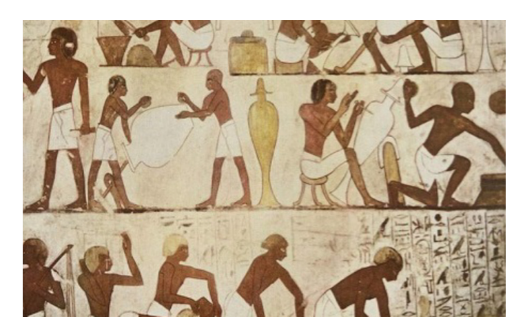
Fig. 2. Egyptian mural. ca. 1100 B.C. [4].