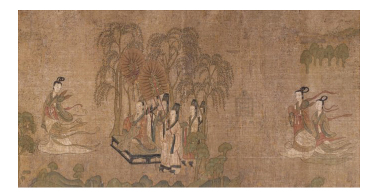
Fig. 3. Painting of the ode of the River Goddess, Gu Kaizhi, A.D. 348-409 [5].

Chinese early paintings, like early Egyptian art, use exaggeration to highlight the main characters, to distinguish their status hierarchy, e.g., see the Lo River map (Fig. 3). In early Christian religious painting, the halo is used to distinguish between saint and man (Fig. 4a). The same technique can be found in Buddhist paintings (Fig. 4b) where the Buddha has a head halo and a back halo, which represents the highest level of this god. Some gods only feature a head light, indicating the difference in rank. This style shows many expressive techniques in painting and sculpture, representing the meaning as well as the specific style and workmanship, which is related to a specific period. These characteristics often are used as the basis for dating.