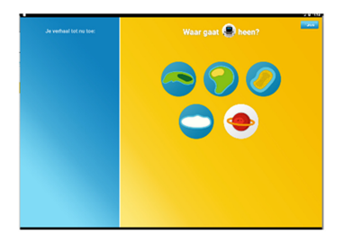
3. Location selection screen. The user can select where Cozmo travels in the story. Again, at the left the story overview is presented. The button in the top right can be pressed to return to the previous screen.