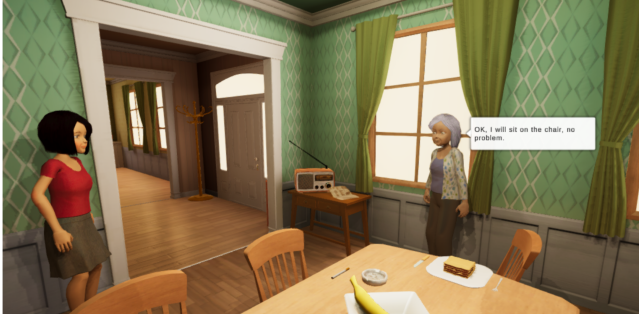
Figure 3: Screenshot of the Alzheimer Care Trainer. In the sentence “OK, I will sit on the chair, no problem”, “sit on the chair” is inserted dynamically (slot mechanism).

and the current situation in the game. ExpReal also generates texts on the menu buttons that depend on the game state. It is called by the parent narrative engine, which determines the possible choices of the user and the reactions of the simulated patient (Figure 3).