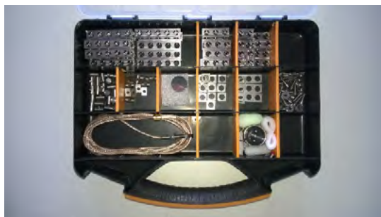
Fig. 2. The lab in a box

In addition to the lab-in-a-box mechanics, an electronics box is provided. This electronics box can be connected to the actuator and sensor, and its microcontroller can be programmed on the student's laptop via Matlab-Simulink. The electronics box is also used to control a linear stage during the practical. The lab-in-a-box and electronic box are portable and can thus be used at any convenient location (Fig. 3).