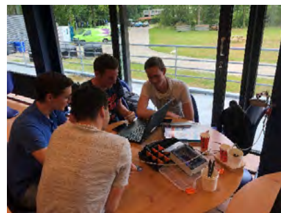
Fig. 3. The lab in a box in use

The actual realization of the mechatronic design and the experimental verification provide the students with the experience that reality deviates from theory, typically by unmodelled phenomena. They have to track and explain deviations, which requires them to combine modelling and experimental skills and provides insight in the interrelation of the disciplines. The lab-in-a-box allows adaptation of the design and retuning of the controller to adapt the system to these new insights.