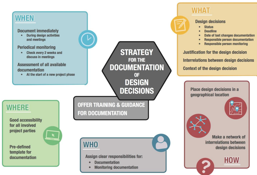
Figure 1. The concept strategy, showing all elements

The assessment of all available documentation at the start of a new project phase is addressed. This is included in the last level as findings indicate that performing this effectively could only be achieved if the assessors have a good understanding of what documentation should be available and what quality this should have. It is important that all design activities are postponed until the assessment is finished.