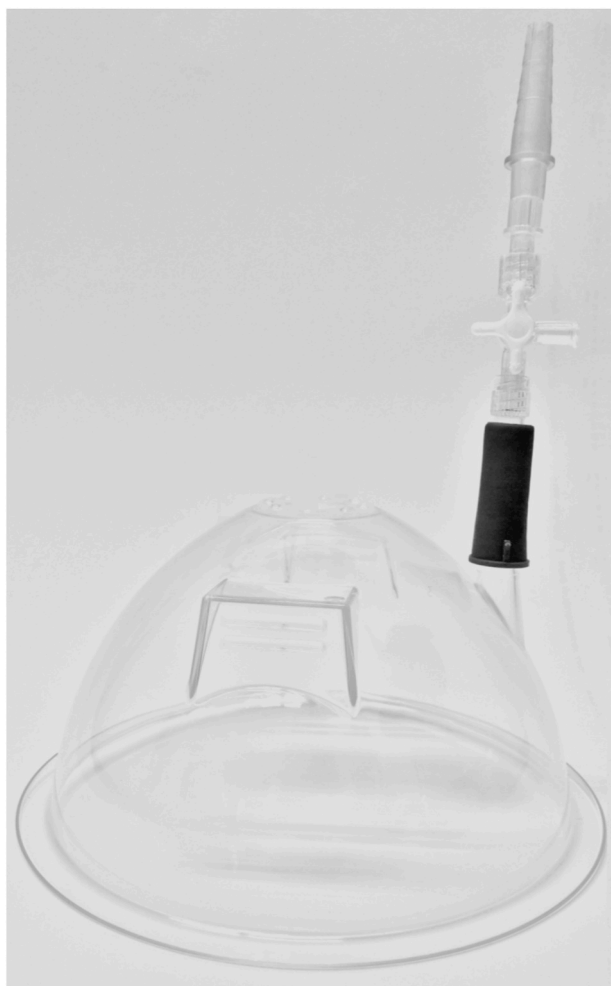
Fig. 1. The abdominal wall entry suction device (AWESD).