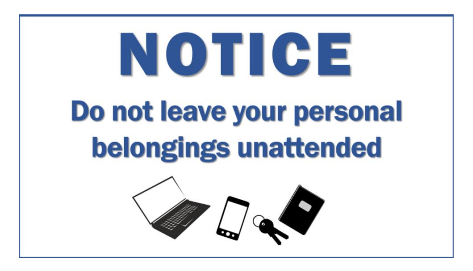
Figure 3: Design of the warning banner used as the intervention

Studies by (Beaman et al., 1979; Bhattacherjee, 2012; Nettle et al., 2012) provided guidelines for the design of the warning banner. The text of the banner was "NOTICE: Do not leave your personal belongings unattended", followed by silhouettes of everyday use objects -- laptop, mobile phone, keys, and a notebook. The text color was chosen to be blue because it is a warm, communicative, and a peaceful color ("How Does the Color Blue Make You Feel?," n.d.). The warning's aim was to remind subjects to be more careful with their belongings, subconsciously increasing their awareness. The design of the warning banner is shown in Figure 3.