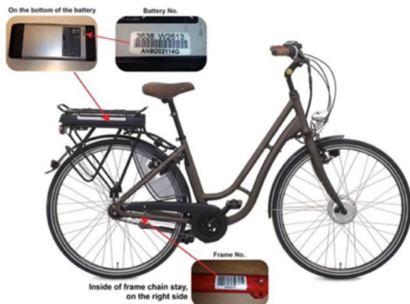
(C) Recall of the product from end users in Europe (example of product-environment integration issues)

In addition to highlighting the needs for integration, this paper reviews currently used tools and discusses the ingredients for safe integration. Section II provides a review of tools and techniques. The outcomes have been further discussed in Section III, where a systemic approach for safe integration is described. Section IV presents an example application for the safe integration of bicycles to the urban system. Conclusions are drawn in Section V.