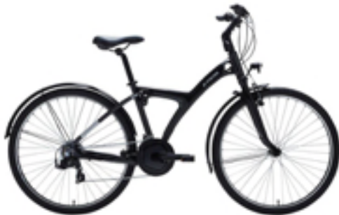
(A) Recall of the product from end users in Europe (example of internal integration issues)