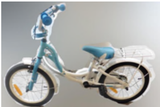
(B) Recall of the product from end users in Europe (example of product-user integration issues)