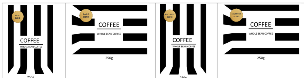
Fig. 2. The finalized ad display variants used in the main study. (left two panels: ‘basic blend’ claim; right two panels: ‘exclusive blend’ claim).

Analyses of variance with ad display (vertical versus horizontal) and brand claim (exclusive versus basic blend) as independent variables, and respectively luxury and quality perceptions, taste intensity and taste liking, purchase intention, and consequences of coffee