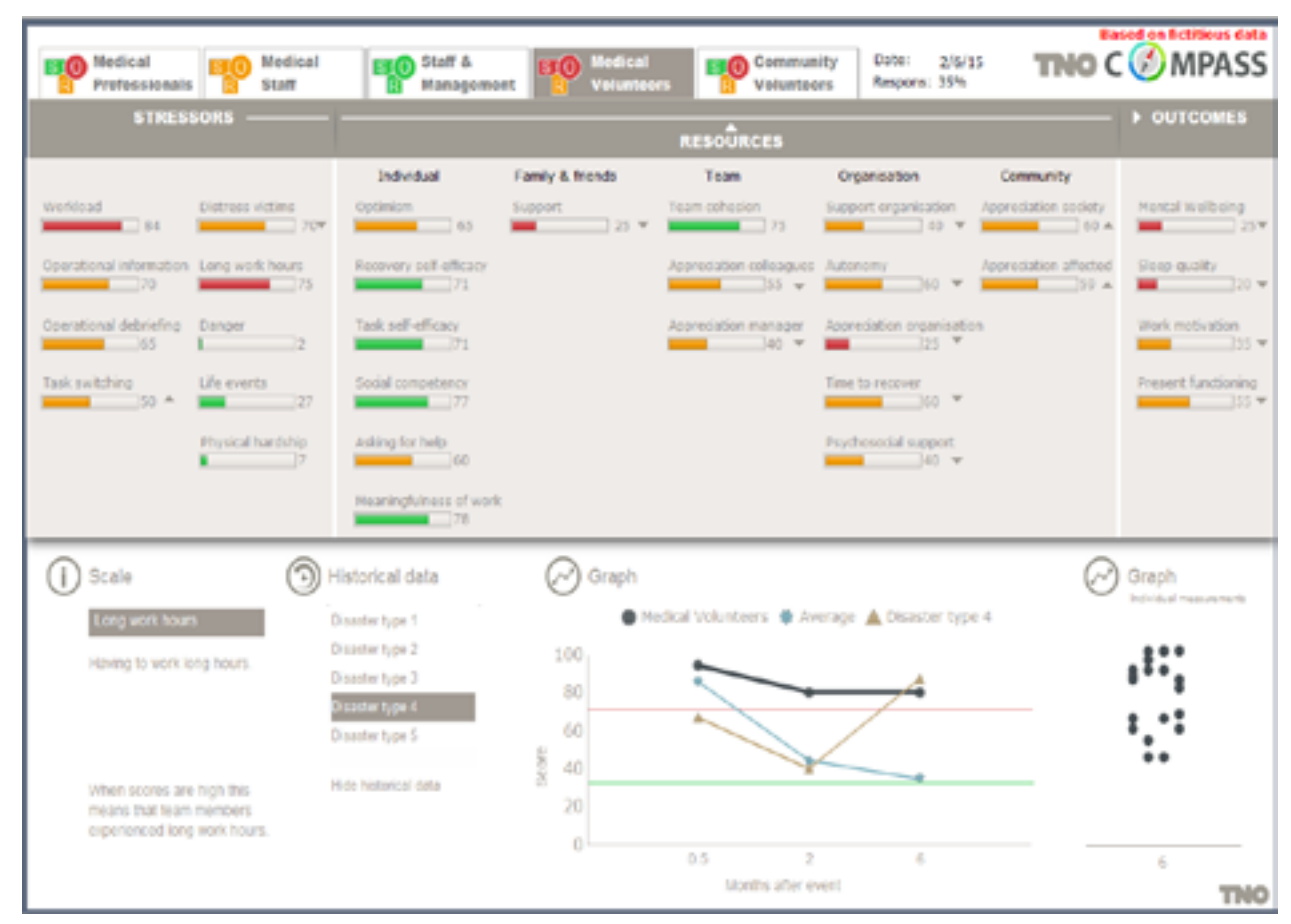
Figure 4. Example dashboard concerning the psychosocial well-being of selected groups during disasters (OPSIC, 2016).

understanding the displayed information at a glance. The realization of a dashboard's potential can be expressed in several performance scores, such as effectiveness and efficiency. Effectiveness expresses the degree to which a dashboard communicates its message correctly. Effectiveness can for example be derived from the number of interpretation mistakes. Efficiency expresses the amount of effort required to perceive (cognitively process) the information presented by a dashboard. Efficiency scores can for instance be computed from observer response times and visual scan paths.