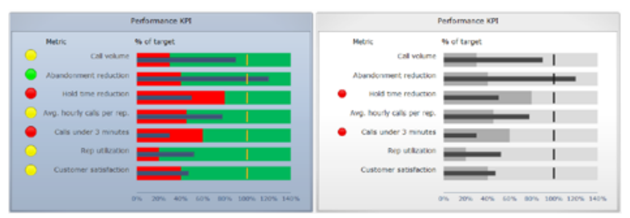
Figure 3. Left: an example of the overuse of both color and alerts. Right: an example of a better design (example Few, 2013).

the potential does not provide information on how easy the objectives of the user can be met. This will be the focus of criterion three.