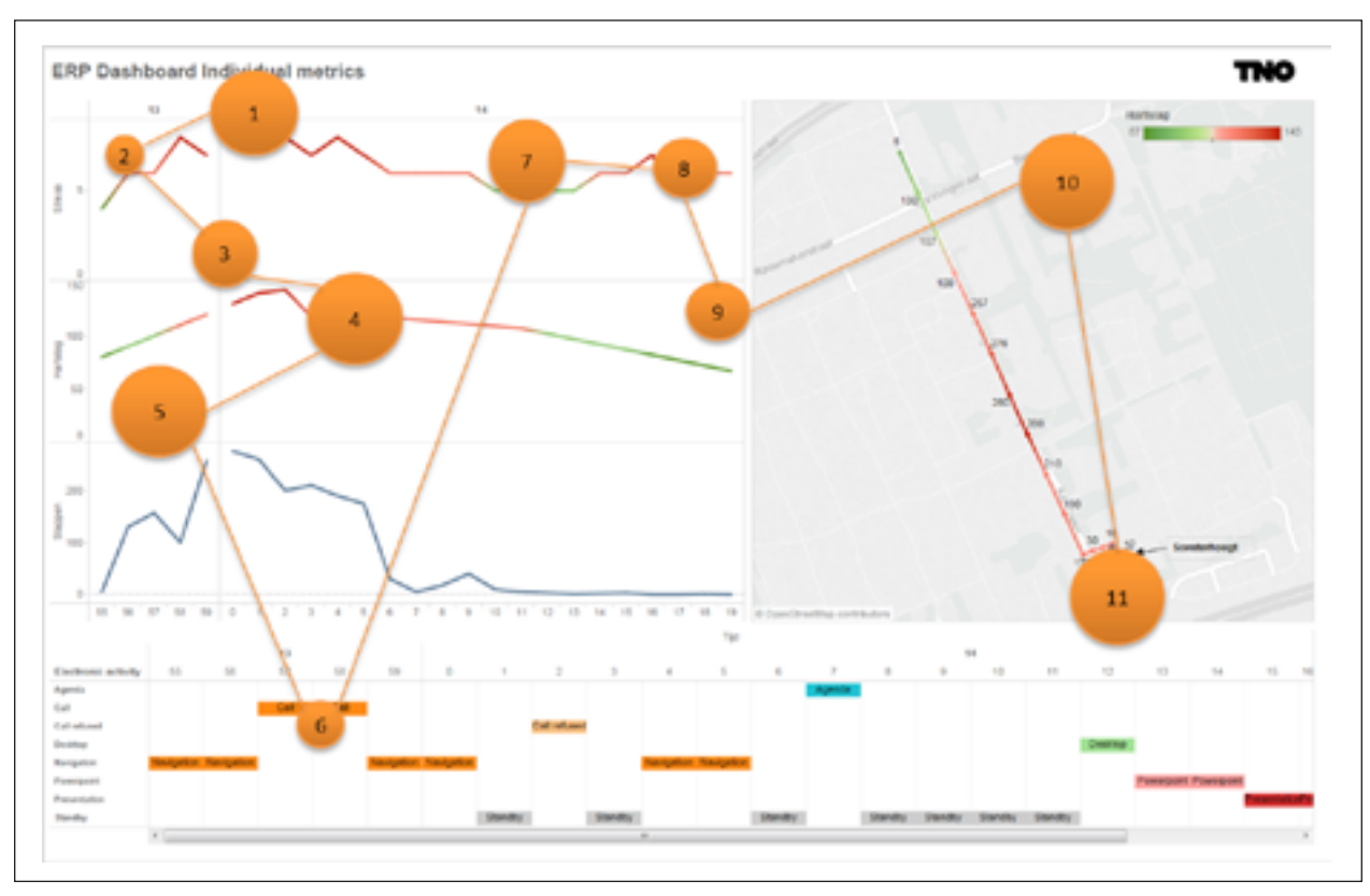
Figure 2. An example of a dashboard with eye-tracking data gathered during an experiment. The dashboard combines several individual health metrics like stress, hart rate, activity and physical location.