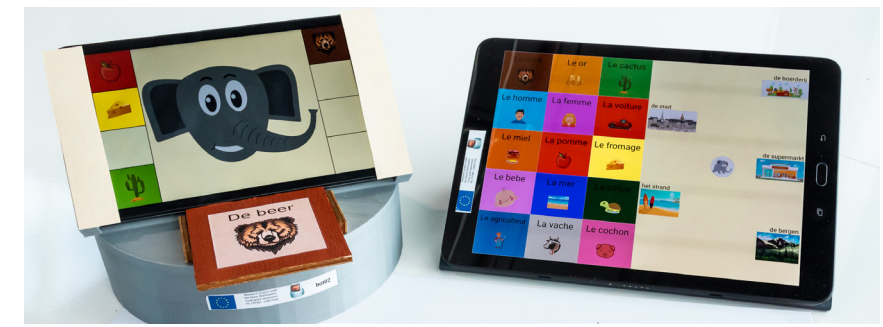
Fig. 2. Left) Elephant in a surfacebot; Right) Screen of the Child UI app.

The workflow of the activity is as follows. The robot introduces himself and his need to learn some French with the children's help on his way to the beach in France. Then children can explore going from one location to another, using the objects, and listening to the story suggestions given by the elephant. The objects can be used in the story by physically transporting the object tiles between locations using a tray fixed on the robot (see Fig. 2-Left). When children teach a word to the robot or fail to reteach on time, emotional responses and utterances are properly provided by the robot, controlled by the teleop in our implementation.