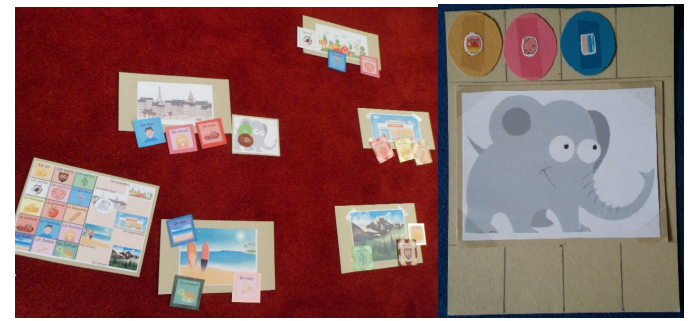
Fig. 1. Left) Lofi paper prototype; Right) Word-learning progression mock-up.

old, average 8) showed that these revisions worked reasonably well, leaving the children with enough freedom to come up with their own story by deciding where to go and with what object to interact. We only needed to make some minor adjustments to the story-related sentences before finalizing the prototype. Because it was not fully clear to the children how they could interact with the tangible objects, in the hifi prototype we provided a way for the robot to physically carry a tile and move it around between locations.