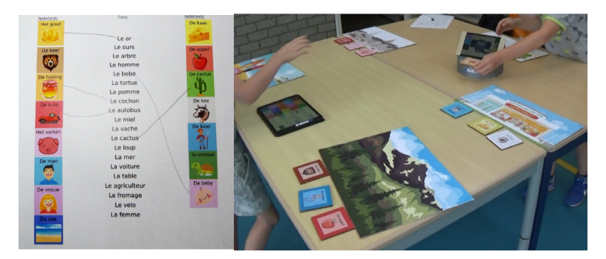
Fig. 3. Left) Language questionnaire. Right) groups playing during the learning activity, child putting the honey on the robot and discussing the action with the child behind the tablet.

Children participated in the activity in pairs in a separate room. One child was the tablet operator, who was responsible for teaching the words to the robot. The other one was the robot operator, who had to move the robot to the right physical location on the tabletop and handle the tangible object tiles. Both roles remained unchanged during the activity. They had to cooperate, but their responsibilities and the way they experienced the materials were slightly different (see Fig. 3-Right). The activity lasted ten minutes. Video recordings were made during the activity to facilitate the review of any remarkable behavior. Children were informed after the post-test that tele-operation had taken place.