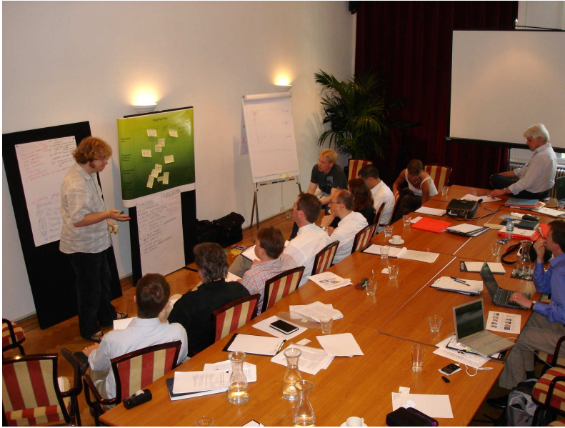
Figure 1: Workshop session, 12 th June 2006, De Rode Hoed, Amsterdam

The process topic was how to deal with roadmapping and strategy articulation in an emerging field where the complex mix of varying and evolving research lines need to coordinate to enable an integrated analysis platform. Together with representatives for the research sector, technology assessment and industry sectors, the Frontiers team will explore some of the issues involved with integrating a number of research lines, how to develop a roadmap but maintain flexibility to allow further research and integration of results from more fundamental research orientations.