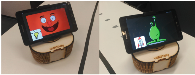
Fig. 1. Examples of screens on the surfacebot representing a character. Story assets are shown in the bottom left corner of the screen.

We have developed a functional prototype to start exploring how children interact with a surfacebot while using it to tell stories. The choice of the components pursues a balance in features and costs with regard to other robotic platforms, while allowing children to interact through touch input remotely with the tablets available at school. The prototype consists of a robot-tablet (surfacebot) that embodies a character (see Fig. 1). Using a moving tablet to embody a character allows us to show a digital representation of the character's facial expressions and intentions on screen while also allowing it to move around in the physical play area. However, before testing more advanced interactive features with children (e.g. self-driven and autonomous behavior in the surfacebot), we have focused on a limited version of a surfacebot character.