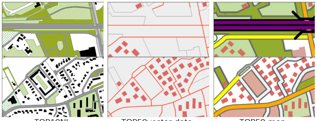
TOP10NLTOP50vector dataTOP50 mapFigure 3: Displacement of features in TOP50vector triggered by graphical conflicts of<br/>symbolised features in 1:50k map

For the Kadaster case we can say that the DLM-DCM concept is mixed in the smaller scale data sets. The DCM concept is incorporated because the sources of the multi-scale data sets are the TOPxxvector data sets of which the geometries are based on their appearance on the map. For example, a motorway at 1:50k is portrayed with a line-symbol of width 1.5 mm, which is 75 metres in reality. To avoid overlap of the motorway symbol with other features such as buildings, features are displaced and simplified. Creating the map is a simple operation, which adds symbols to the geometries in the vector datasets (see Figure 3).