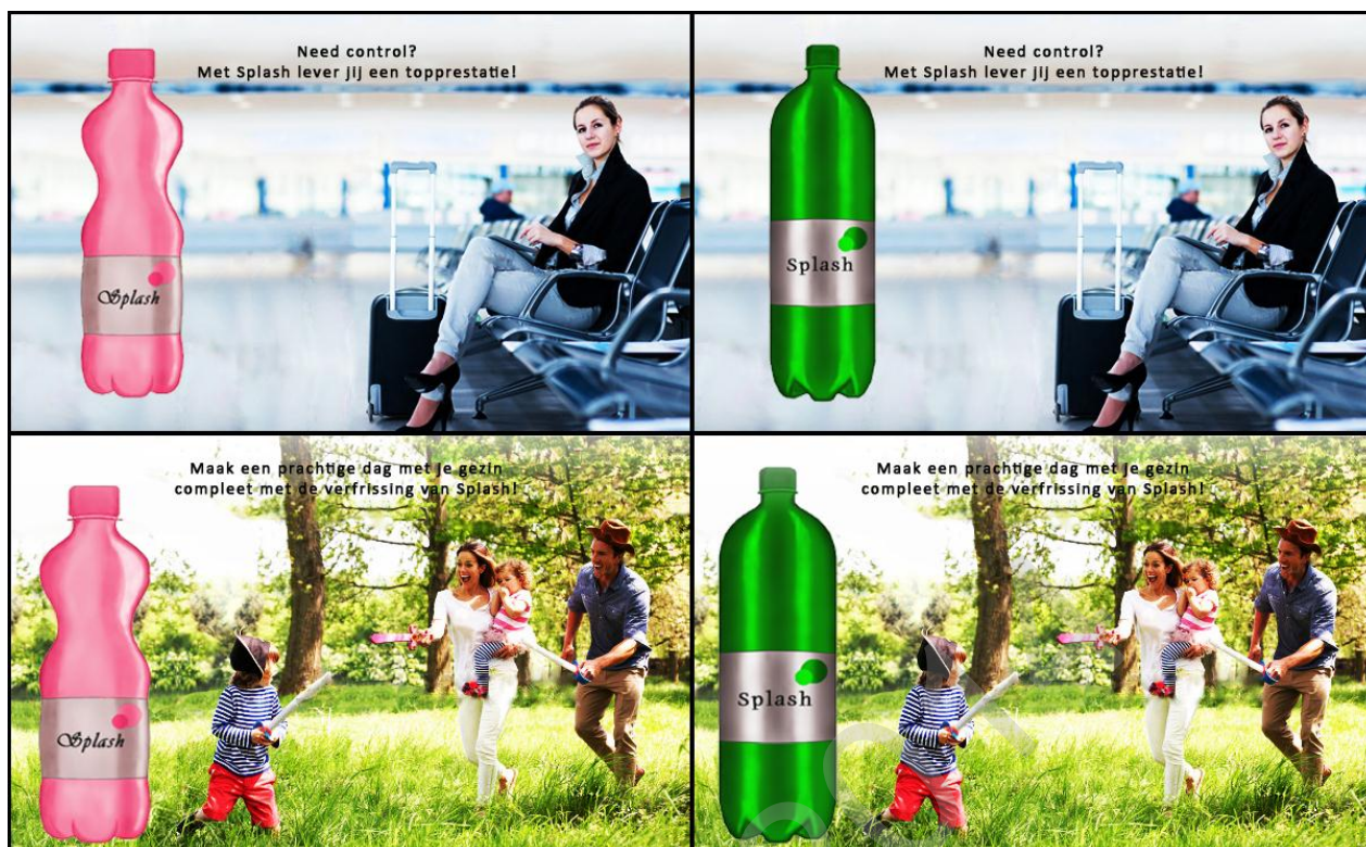
Figure 1. Stimuli used the experiment. Upper left: stereotypical product design and independent advertising scenario; upper right: gender-neutral product design and independent scenario; bottom left: stereotypical product and interdependent scenario; gender-neutral product and interdependent scenario.