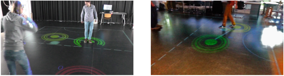
Fig. 1. The Distributed Interactive Pong Playground (DIPP). In this configuration, two opposing players are collocated and have distributed teammates, the paddle can be seen between the distributed team of green (L) and yellow (R). (Color figure online)

also welcomed for local players to team up during the Breakout for two games to increase throughput, to our knowledge there are not yet team distributed exertion games [10,18].