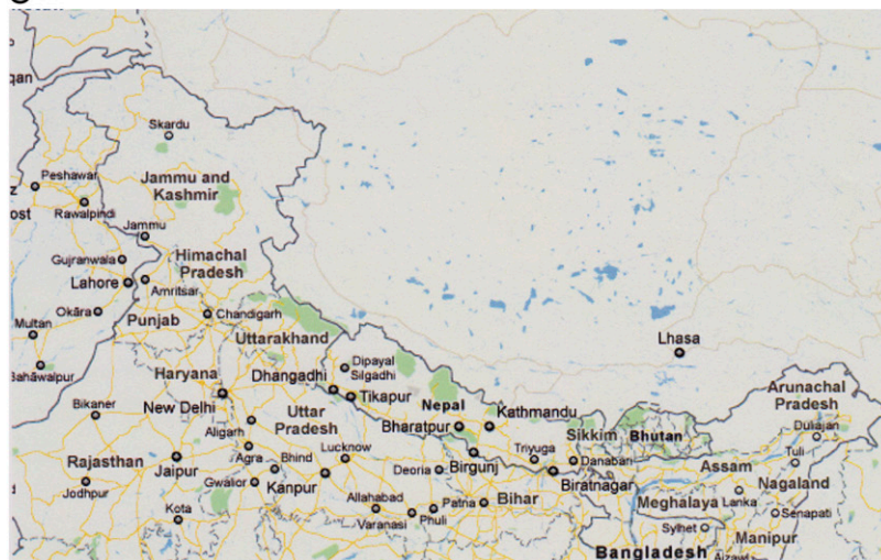
Fig. 3. Three versions of the boundaries of the Himalayas, as provided by Google Maps in response to queries from (A) the US, (B) China, and (C) India.

among the private sector, academia, non-governmental organizations, and government, focused on Digital Earth, might be similarly successful.