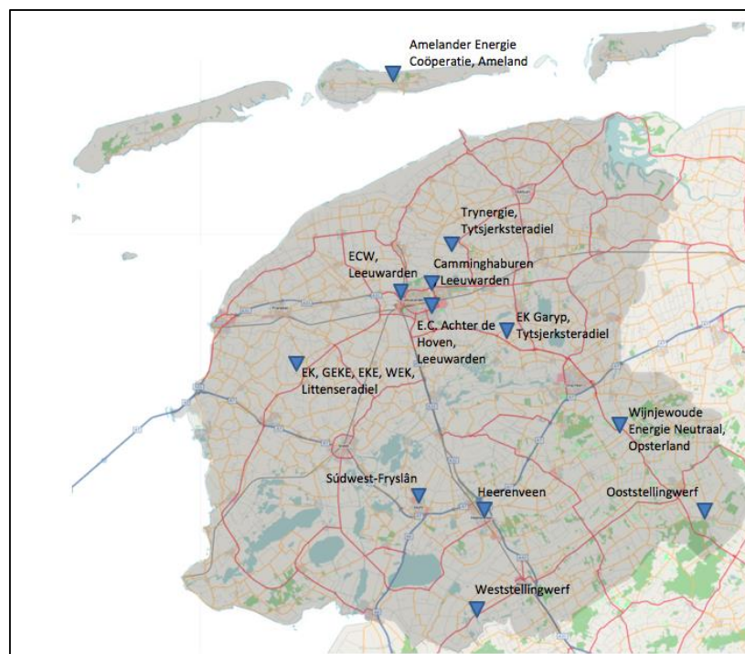
Figure 5. Map of embedded cases in Fryslân showing the municipalities and the LLCEIs in question.