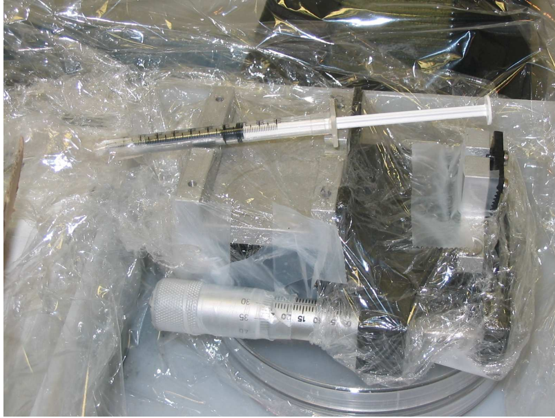
Figure S4. Syringe filled with mercury and positioning table to move the plunger of the syringe.