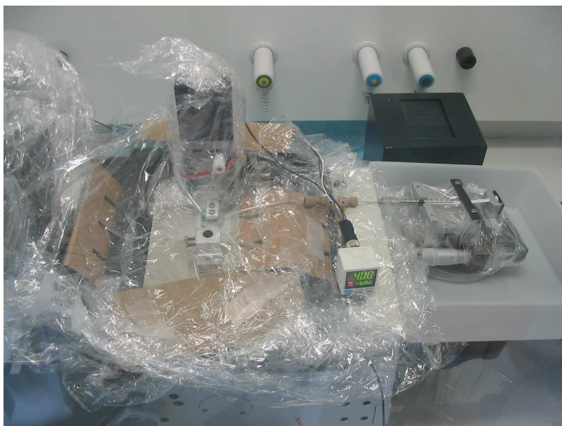
Figure S2. Experimental setup, on the right the syringe next to the pressure sensor and translation motor on the left.