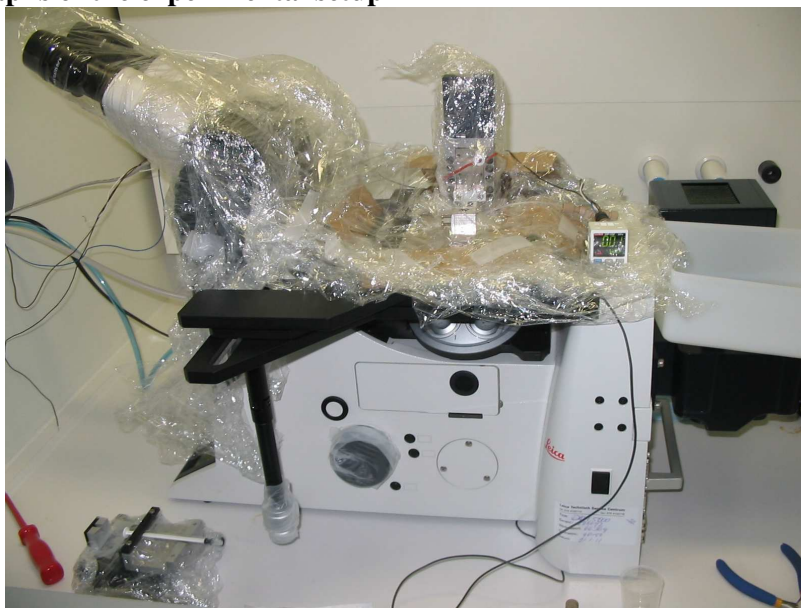
Figure S1. Inverted optical microscope covered with plastic foil.