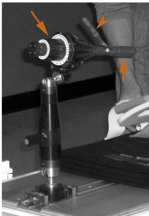
Fig. 3 – APT-MRI device for transrectal prostate biopsy. Note the endorectal probe (black arrow), needle guide (arrowhead), and rotation and angle dials (white arrow) that are controlled manually based on output from the targeting software.

Zangos et al [37] used a device for transgluteal biopsies in a closed-bore system. Transgluteal biopsies minimize the risk of injury to the bladder, bowel, and iliac vessels, and no intestinal germs are introduced into the prostate. Disadvantages of this method are the need for local or general anesthesia and the longer biopsy pathway. The device uses markers on the hydrolic guiding arm, and a system cart to control the drives and optical sensors. Interactive Innomotion software is used for planning and for controlling the biopsy. This device was used in a cadaver study, in which the cadaver was placed in a prone or lateral position. The insertion point and target were marked on T2-weighted MR images, and the biopsy path was calculated automatically. The needle was inserted manually by the physician after the cadaver was removed from the scanner. The mean deviation of the needle tip was 0.35 mm (range 0.08–1.08 mm). In all cases, the target was reached on the initial attempt. This technique has not been used in clinical practice.