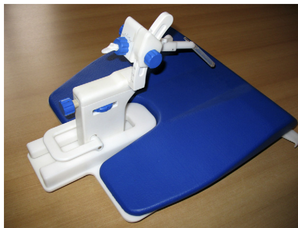
Fig. 1 – Biopsy device with base plate and cushion for patient positioning (Invivo, Schwerin, Germany).

An MR-compatible biopsy device used in clinical practice was used by Beyersdorff et al [21] (Fig. 1). A needle guide was inserted into the rectum and connected to this device. The