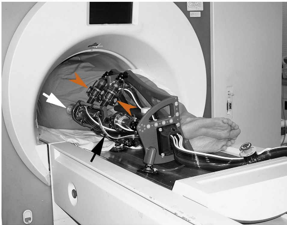
Fig. 4 – MrBot (black arrow) aligned with the patient in decubitus position. Pneumatic stepper motors (arrowheads) orient the end effector for transperineal intervention (white arrow) based on output from the guiding software.

prostate. The robot mounts on the imager's table alongside the patient, who is placed in the decubitus position, and it is capable of orienting and operating a biopsy needle under direct MRI guidance (Fig. 4). The T2-weighted TSE sequence data transferred from the imager are used by custom software to define the targets and the entry points for the needle on the three-dimensional coordinate system of the MR image. The same software is used to calculate the coordinates for the respective positions in the coordinate system of the robot to guide the robot in performing automated, target-centered needle placements.