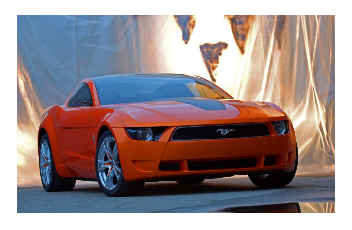
Figure 1: Will tyre/road noise be dominant now?

Traffic noise is considered to be an important environmental problem, leads to annoyance and even health damage. The interaction between the tyre and road surface causes tyre vibrations and air displacements, by which sound is generated (figure 2). Today tyre/road noise is the dominant noise source for driving speeds exceeding 40 km/h (figure 1).