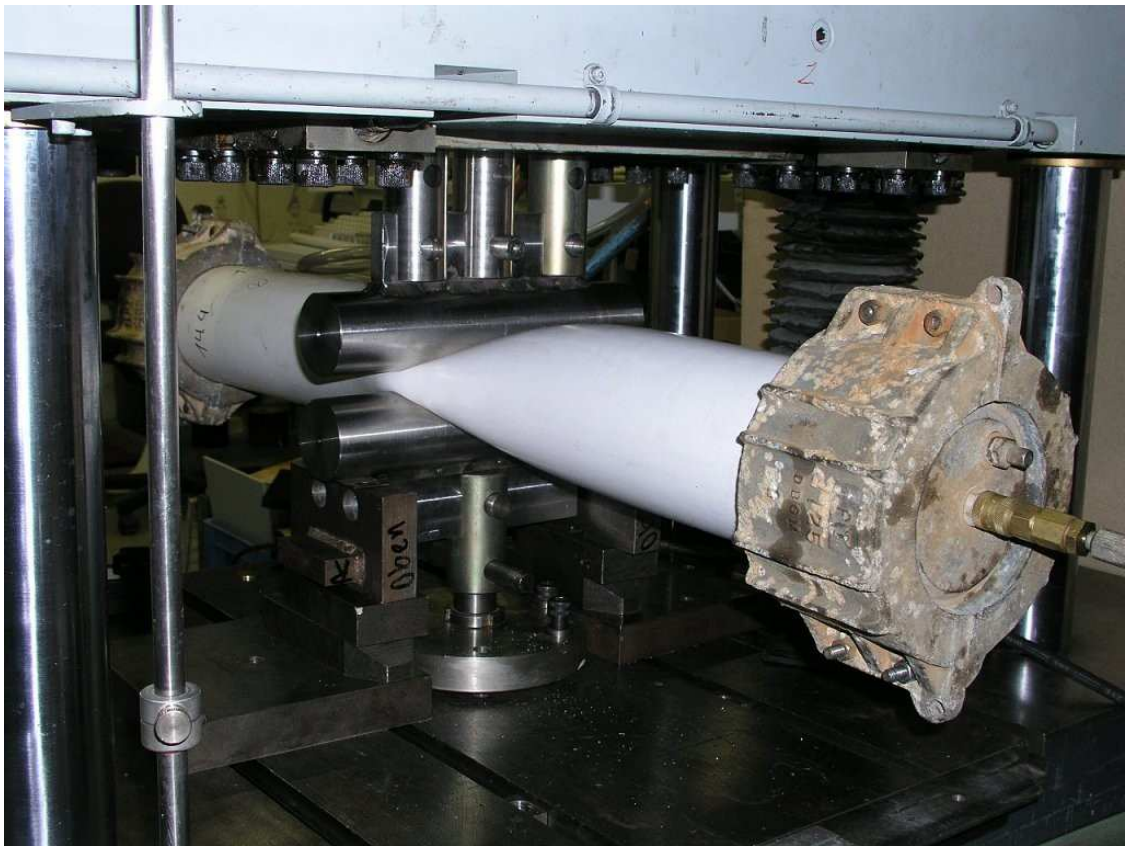
Fig. 3. Squeezing of a 125 mm RTP "light" pipe

One of the advantages of plastic pipeline systems is that when an accident or incident is occurring the gas stream can be interrupted by squeezing of the pipe at operating pressure. For PE pipelines this is a well-proven practice. This squeezing technique can be applied as well to RTP pipes, at least at reduced pressures. Tests on 125 mm RTP pipes have shown that at pressures below 8 bar the gas stream can be stopped almost completely when squeezing the pipe ( see fig. 3 ). Squeezing, however, damages the pipe material. This means that the squeezed part has to be replaced or be repaired by a sleeve around the damaged part.