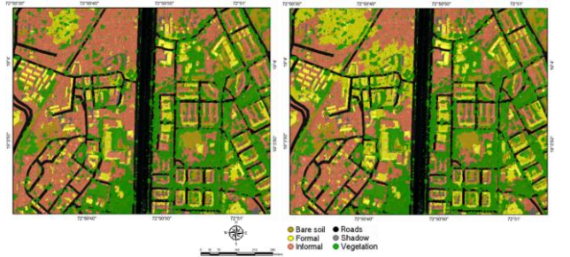
Figure 5. Subset 3 before (left) and after adaption (right)

Next, the same rule set was applied on subset 2 and 3 (Figure 4 and 5) and accuracies were measured. The overall accuracies before adaptation for subset 2 and 3 were 79% and 82% respectively. Thus for both subsets the accuracies were lower than that of subset 1. This required adapting the parameters to improve the classification accuracies to be similar or better than for subset 1. After adapting the rule sets, the overall classification accuracies for subset 2 and subset 3 were 85% and 86%, while for the informal settlements class, the accuracies were 82% and 86% respectively. Henceforth, we considered not only qualities but also the deviation of relative change of membership functions in evaluating the robustness of rule sets.