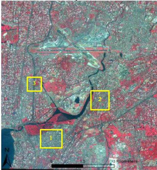
Figure 1. Location of subsets (WorldView-2 image 2009)

Fieldwork was conducted in 2015. 150 ground control points were collected within the subsets using quota sampling.