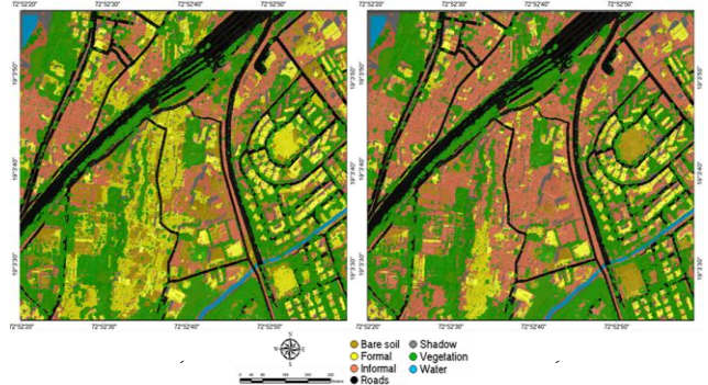
Figure 4. Subset 2 before (left) and after adaption (right)