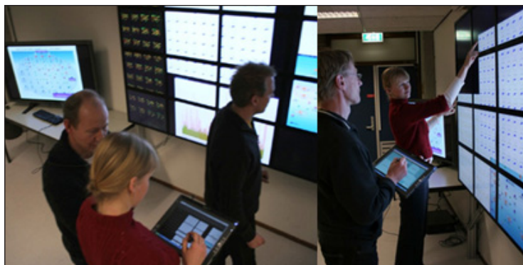
Figure 1. Scientists interacting with multiple visualisations in e-BioLab, MAD/IBU, University of Amsterdam

experiment design stage, a statistician needs to establish confidence intervals and statistical power of an analysis. However, only molecular biologists and microarray experts can assess whether it is experimentally possible in the wet-lab to increase statistical power or to avoid confounding by choosing a different experimental setup.