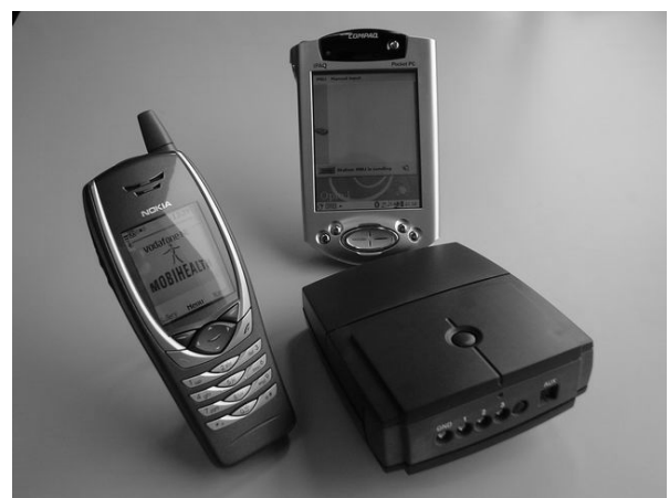
Figure 3 MobiHealth UMTS Trauma BAN

communication. The front-end also allows ZigBee [1] as an alternative intra-BAN communication technology.