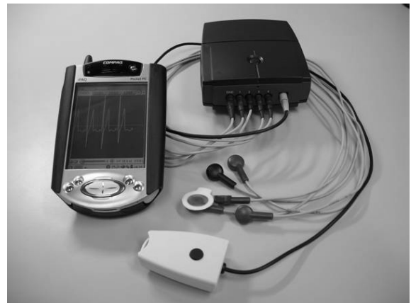
Figure 2 MobiHealth GPRS Pregnancy BAN

The BAN has been implemented using both front-end supported and self-supporting sensors. Fig. 2 shows the MobiHealth system with TMSI front-end sensors, configured for GPRS communication, while figure 3 shows the UMTS configurations (excluding the sensors). Both configurations use Bluetooth for intra-BAN