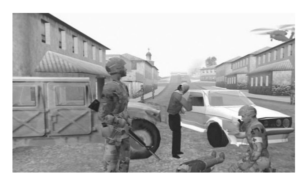
Figure 6: Multi-party interaction in the Mission Rehearsal Exercise

Another example, where the starting point is the virtual world inhabited by autonomous agents, is the Mission Rehearsal Example (MRE) environment (Traum and Rickel 2001) developed at the Institute for Creative Technologies.