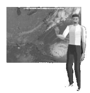
Figure 7: Tactical Language Training project