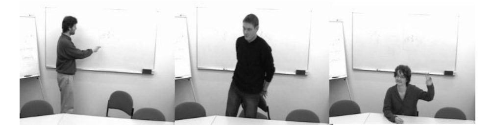
Figure 2: Pointing, rising and voting

information (e.g., speech and gestures) and speaker tracking (e.g., while the speaker rises from his chair and walks to the whiteboard) are similar issues. Other, more detailed but nevertheless relevant meeting acts can be distinguished. In Zobl et al. 2003 recognition of individual meeting actions by video sequence processing in the context of the M4 project is discussed. Examples of actions that are distinguished are entering, leaving, rising, sitting, shaking head, nodding, voting (raising hand) and pointing (see Figure 2). These are rather simple actions and clearly they need to be given an interpretation in the context of the meeting. Or rather, these actions need to be interpreted as part of other actions and verbal and nonverbal interactions between participants. Presently models, annotation tools and mark-up languages are being developed in the project that allow the description of the relevant issues during a meeting, including temporal aspects and including some low-level fusion of media streams. Higher-level fusion, where also semantic modeling of verbal and nonverbal utterances is taken into account has not been done yet. In some cases it turns out to be more convenient to make shortcuts to a pragmatic level of fusion using knowledge from the application.