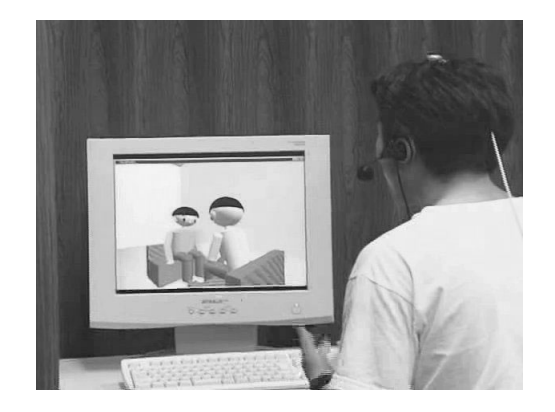
Figure 5: Real-time transformation of conversational gestures

Translation of this work to a smart meeting environment is straightforward. Once we can capture the events in a physical meeting room we can translate them to events in a virtual meeting room (see e.g. Figure 5) and add remote participants or add model-based behavior to virtually represented participants. For example, focus tracking (Stiefelhagen 2002) can be enhanced and converted into gaze behavior of virtual meeting participants. Assigning desirable properties to avatars that represent human participants during a meeting may much more smoothen the progress of a meeting than when the real participants are represented with all their particularities. This view allows a particular participant to become more lively through more extrovert gestures and facial ex-