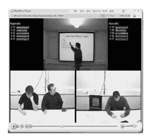
Figure 1: Three cameras capturing a mock-up meeting

In order to collect multimodal meeting information scripted meetings have been organized in which participants act according to prescribed rules that define periods of monologue, discussion, note taking, or a whiteboard presentation. The corpus thus obtained allows study of meeting participants' behavior. In Figure 1 we show a three-camera view of a