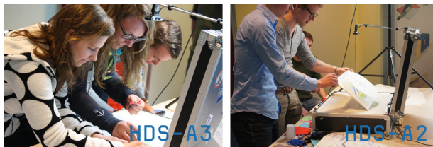
Figure 5. Hybrid design interaction with tool