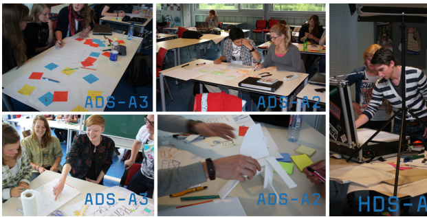
Figure 4. Collaborative mindmapping and brainstorm sessions.