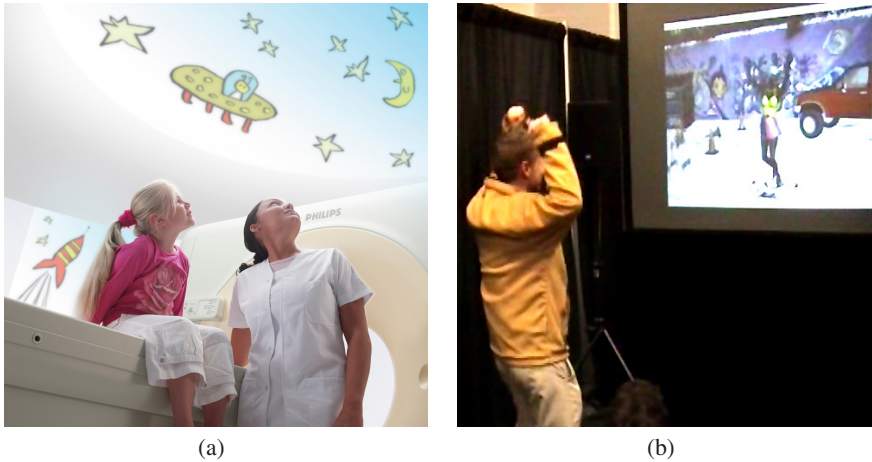
Fig. 2. (a) Philips' vision of smart homes: the environment is adjusted to make patients feel more comfortable in hospitals. (b) User interacting with the Virtual Dancer.

home that supports elderly people in order to allow them to live (semi-)independently. These homes not only take care of lighting and heating issues, but also facilitate communication in case of emergencies.