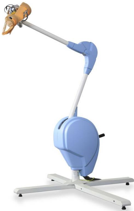
Figure 1. Prototype of the Active Therapeutic Device (ATD).

For this purpose, a new hybrid Active Therapeutic Device (ATD) is being built, see Fig.1. The ATD will consist of a robotic manipulator with the main purpose to support the arm. Besides counteracting gravitational forces on the arm, the ATD can also provide small assisting or resisting forces by tilting the supporting force vector. A manually adjustable spring delivers a constant primary supporting force. Electric motors apply secondary variations to the magnitude and direction of the primary (supporting) force. Due to these variations in magnitude and direction of force, several training modalities are possible, such as actively assisted training, actively resisted training, and haptic simulation.