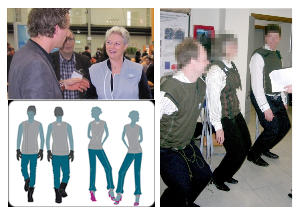
Figure 1: Dutch minister of Economic Affairs wearing a Feel The Music Suit at a public event (topleft). On the bottom left, design sketches of the suit. On the right, a demonstration of the TNO tactile dance suit showing coordinated dance movements by three users.

A good example of innovative audio content with well-being application is Meditainment [19] (= Meditation + Entertainment), which combines relaxing music, ambient soundscapes, nature sounds, voice coaching and guided meditation and visualisation techniques. One particular use of this content which is reportedly being investigated is pain management for hospital patients. Typically, the audio content in existing products such as Meditainment is static, id est not interacting with the user nor automatically adapting to the user. One of our hypotheses is that making this content more adaptive to the user could make audio stimulation much more effective and attractive.