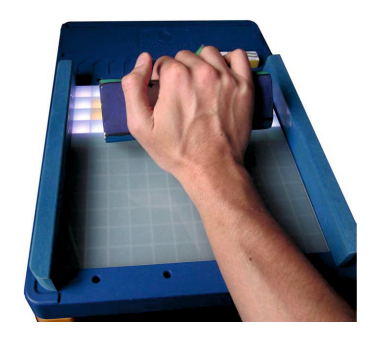
Fig. 4. Hearing the answers in the "Ik hou van Holland" game: tumbling a block, targets a passive form of rotating the hand backwards