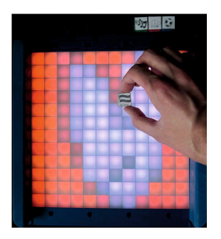
Fig. 5. The start of the "Ik hou van Holland" game. Placement of a wooden cube to select a category which triggers the shown "pincher grasp"